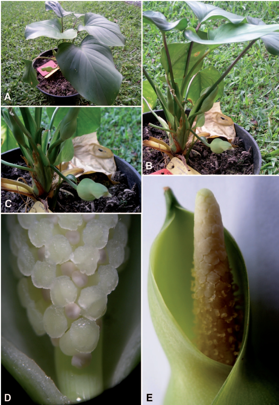
Fig. 1. Homalomena tirtae – A–C: habit of the plant in cultivation in the Bali Botanic Garden, source of the holotype; note the green spathe, open petiolar sheath and the brownish staining of the petiole; D: detail of pistillate flower zone at pistillate anthesis, showing the pistils exceeding the interstaminal nodes and the 3-lobed stigmas; E: inflorescence at late staminate anthesis; note that the terminal portion of the spadix is composed of sterile staminate flowers (no pollen strings released). – Photographs by Ni Putu Sri Asih from I Gede Tirta GT.2105 cultivated as accession E20051213 in the Bali Botanic Garden.