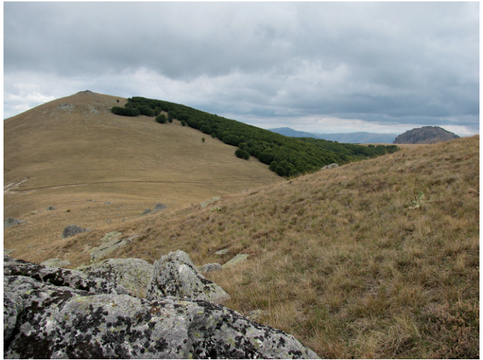
Fig. 3. At 1750–1800 m the upper limit of the Fagus woodland with its sharp margin is clearly a result of the upper part of the woodland having been cut and the area subsequently subjected to grazing, resulting in montane grassland. On the granite outcrop in the foreground a community mainly of Umbilicaria cylindrica and U. polyphylla is present. Mt Vitsi (loc. 3).

*** Parmelia serrana A. Crespo & al. – On N and E sides of boulders and outcrops of gneiss and granite. (1) 14785; (4) 14846; (5) 14755. – Parmelia ernstiae , P. saxatilis and P. serrana are rather similar species. They share a number of characters, which they express to different degrees; they are therefore distinguished by a combination of characters, most of which are not exclusive to any of the species (Thell & al. 2011). Specimens with rather broad and overlapping marginal lobes, branched as well as simple rhizinae, marginal isidia in addition to laminal isidia (the latter mainly on ridges in peripheral parts but may also cover large patches of the central part of the thallus), no or occasionally little pruina, upper surface ± foveolate and no lobules or rarely with lobules developed from isidia in the older part of the thallus are