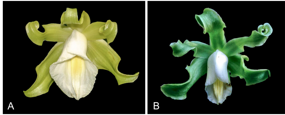
Fig. 2. Flowers of Vanilla guianensis (A) and V. mexicana (B).