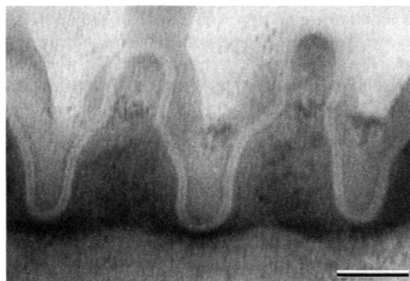
Fig. 3. A transmission electron micrograph of the cross section of the transparent Cephonodes wing, presenting side views of the protuberances. Scale bar: 0.1 \mu\text{m} .

protuberances arranged regular-hexagonally are thought to be most closely packed in two-dimensional space. These morphological characteristics are almost the same as those of the corneal nipple array in the nipple arrangement pattern, center-to-center distance between neighboring nipples, and the size and shape of nipples (Bernhard and Miller, 1962; Bernhard et al. , 1965; Bernhard et al. , 1970). In the Cephonodes wing, morphologies are indistinguishable between dorsal and ventral surfaces, fore and hind wings, and male and female animals. Besides Cephonodes , we have found the wing nipple arrays in the transparent parts of the wings of a hawkmoth, Hemaris radians , a clearing moth, Synanthedon hector , and some cicadae (e.g. Oncotympana maculaticollis ). We have not found them in colored wings of most butterflies and moths, and some cicadae (e.g. Graptopsaltria nigrofuscata ).