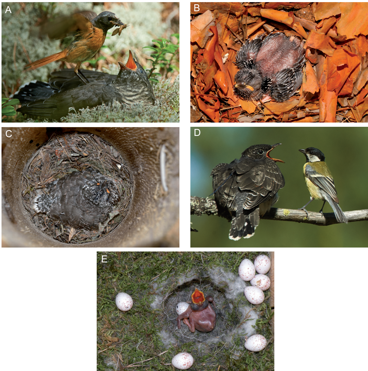
Fig. 1. Cuckoo chicks raised by the Common Redstart (A), Pied Flycatcher (B), Spotted Flycatcher (C), Great Tit (D), and Coal Tit (E). Photographs (A) and (D) are natural parasitism cases, others are from experimental cross-fosterings (see Methods).

evicting all host progeny and were raised together with host chicks (nine chicks in both cases). Cohabiting led to poor growth and consequent death of these Cuckoo chicks on day 9 and 12 post-hatch when they weighed only 11 and 12 g, respectively (normal mass of Cuckoo chicks raised alone in Great Tit nests is 53 and 78 g at these respective ages, Fig. 2D). Another two Cuckoo chicks died most likely due to inclement weather (intense rain, causing soaked nest cup material and chick hypothermia); these chicks died when 5