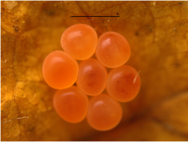
Fig. 4. Paratrachelas maculatus (Thorell, 1875), clutch of first egg sac built around 20.XI.2018. Scale = 1 mm

Nentwig et al. 2018). The record from Cologne is also, to date, the northernmost in its global distribution (Bauer & Grabolle 2012). The southernmost record of P. maculatus currently known is from Israel (Zonstein et al. 2015). In Germany, Paratrachelas maculatus shows a distribution pattern similar to the Mediterranean invaders Zoropsis spinimana (Dufour, 1820) and Cheiracanthium mildei L. Koch, 1864 (Arachnologische Gesellschaft 2018). The second record from Austria (Fig. 1) indicates a possible establishment in Vienna. In 2017 another specimen from Vienna was observed which could, based on its morphology, be identified as male of P. maculatus ( https://forum.arages.de/index.php?topic=23427.0 ), but unfortunately it was not collected. All records were made in autumn, which coincides with the typical phenology of the species (Kovblyuk & Nadolny 2009). The recent records from Stutensee-Blankenloch and the north of Stuttgart are the fifth and sixth in Germany (Arachnologische Gesellschaft 2018), while the record from Vienna was collected at exactly the same locality as another female in 2010 (Bauer & Grabolle 2012). We interpret our data (including a gravid female) as indication that the specimens collected in Germany and Austria originate from established populations, but additional records are needed to prove a (presumed) wider distribution in Austria.