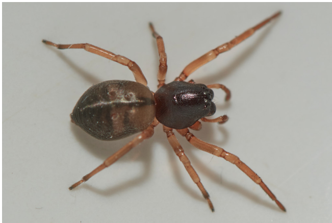
Fig. 1: Paratrachelas maculatus (Thorell, 1875) female from Vienna, Austria (both legs I missing)

Measurements. Prosoma length: 1.85 mm (♀ from Stuttgart), 1.95 mm (♀ from Vienna).