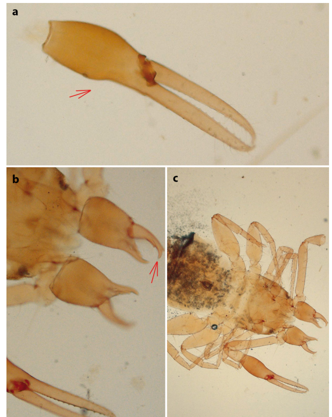
Fig. 3: Ephippiochthonius boldorii , specimen originates from Udava. a. hand of a pedipalpus (arrow = chelal hand with a distinct dorsal depression); b. claws (arrow = cheliceral movable finger without isolated subdistal tooth) on left chelicera; c. body (prosoma), ventral view of E. boldorii

Remarks. Ephippiochthonius tetrachelatus is considered a eurytopic, mainly epigeic species and often represents the most commonly collected species from the family Chthoniidae (Holecová et al. 2012, Christophoryová 2013, Jászayová & Christophoryová 2019, Jászayová & Jászay 2021). Ephippiochthonius tetrachelatus often occurs in leaf litter along southern exposed forest edges or inside sparse forests; it is also fre-