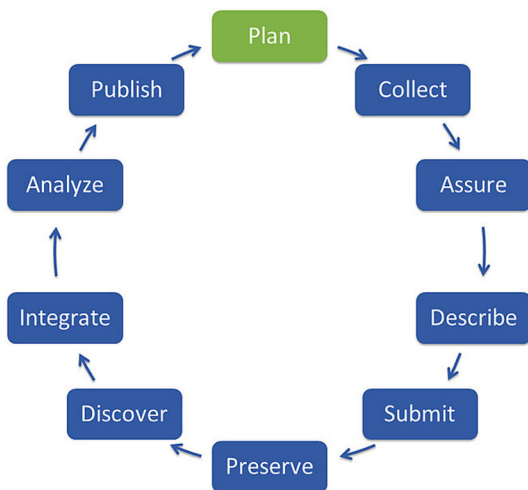
Fig. 1: Idealized, schematic data life cycle. GFBio Training Materials: Data Life Cycle Fact-Sheet: Data Life Cycle: Plan. Retrieved 27 Jun 2022 from https://www.gfbio.org/training/material/data-life-cycle/plan/ .

One early initiative to support the needs of researchers and institutions in managing and sharing their biodiversity and environmental data was the German Federation for Biological Data (GFBio), which emerged from a DFG-funded project and later became an established association (GFBio e. V.) in 2016 (Diepenbroek 2015). The goal of GFBio e. V. is to provide a centralized infrastructure to help scientists managing and sharing biodiversity data along the data life cycle (Fig. 1).