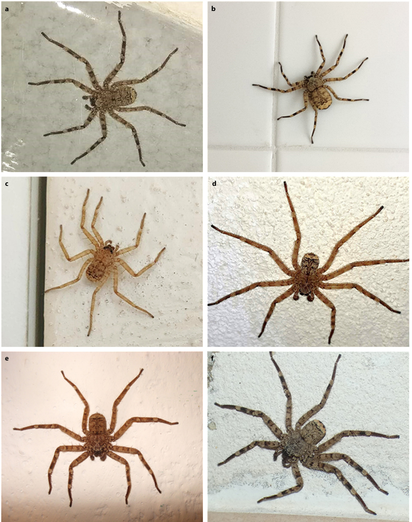
Fig. 2: Some individuals of S. radiatus photographed in Sicily. a. Filicudi, photo by A. Cicerone; b-c. Scicli (RG), photo by N. Curcuraci; d. Modica, photo by A. Maltese; e. Pantelleria island (TP), photo by A. La Rosa; f. Ispica (RG), photo by I. Romano