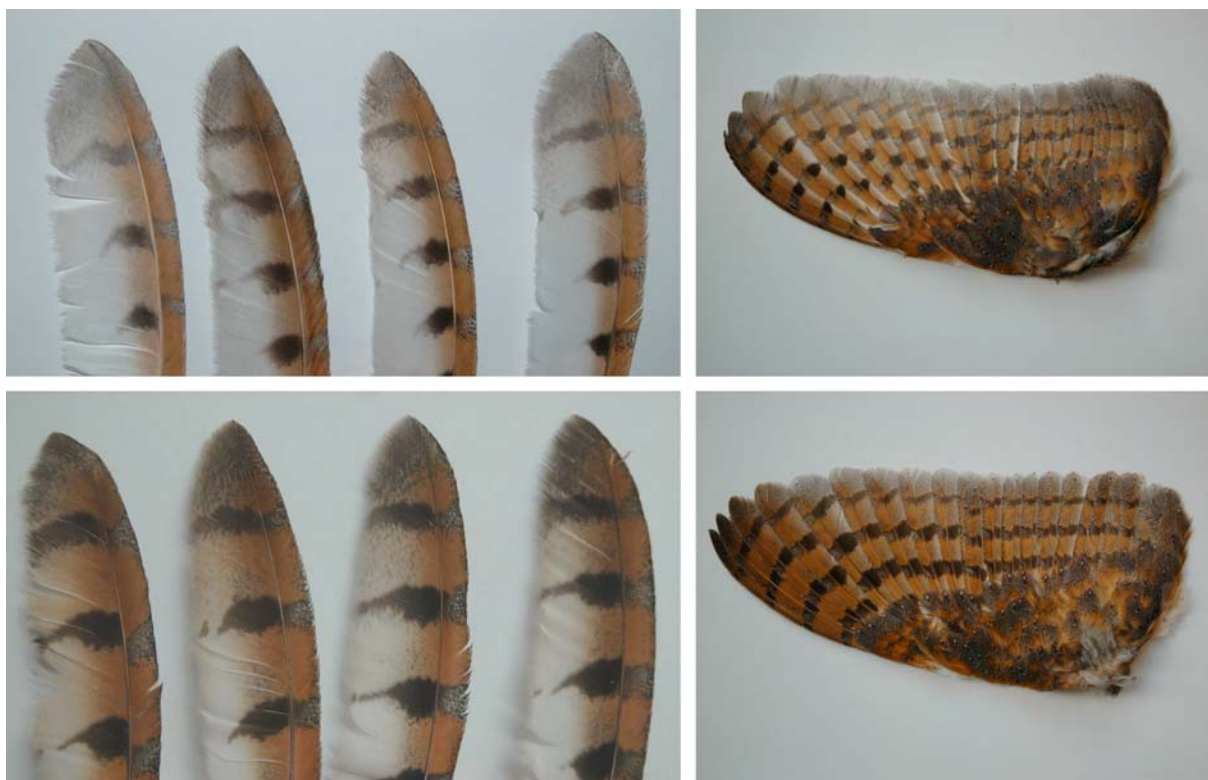
Figure 3. Tips of primaries P8 of four males (top left) and four females (bottom left). Because the bar pattern is repeated in subsequent feathers, complete wings of males (top right) are less heavily barred compared to those of females (bottom right).