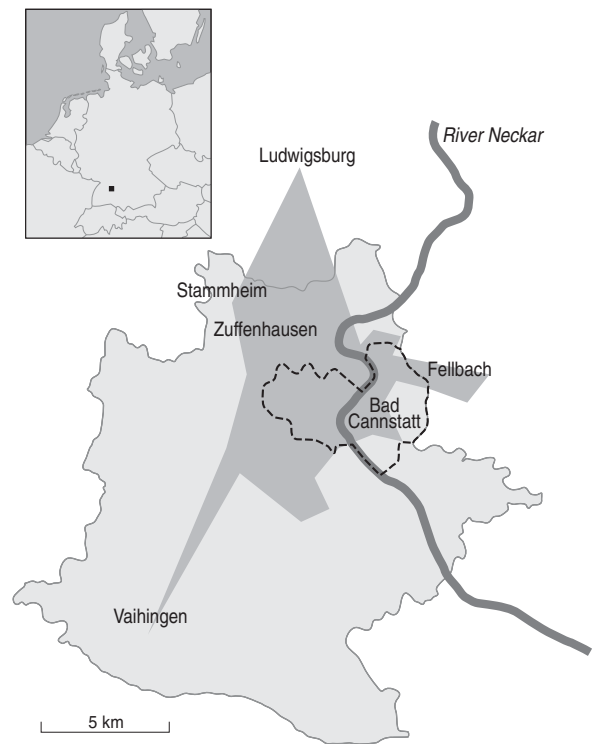
Figure 1. The feeding range of Amazon Parrots within the city of Stuttgart (indicated by the dark grey colour). The city is indicated by a light grey colour. The roost site is located in Bad Cannstatt, a part of Stuttgart indicated by the dotted line. The other district/town names indicate the extent of the known parrot distribution (sightings in those districts).

Since their introduction in 1984 and their first successful brood in 1986, a population of Yellow-headed Amazon Parrots has established itself in Stuttgart (Bauer & Woog 2008) and has grown to a maximum of 46 individuals in winter 2011/2012. In addition, some Blue-fronted Amazon Parrots and their hybrid offspring occur in the area. The population of parrots grows slowly, presumably because the Amazon Parrots start breeding only in their 5th year (Hoppe 1981) and have few young with low survival rates. Mortality in the urban population may occur through road accidents, collisions with electricity cables and windows, getting trapped in chimneys, being illegally shot, or due to cold temperatures in winter (T. Mika, K. Schwarz & C. König, pers. comm.). The Amazon Parrots forage in a large part of the city, specifically in parks, the zoo, various cemeteries and domestic backyards (Figure 1, Hoppe 1999). These areas are rich in native and non-native trees and shrubs from all over the world. Plants were identified using the park tree register and with the help of the botany department at the State Museum of Natural history in Stuttgart. At dusk, birds gather at roosting trees, mainly London Plane Platanus x acerifolia in the district of Bad Cannstatt (N48° 48' 12.7" E9° 13' 5.5", 207m above sea level), close to street lights and heavy traffic. In summer, this roosting site was only used by non-breeders if at all.