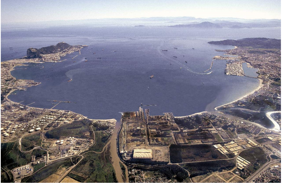
Figure 1. View of the study area with Gibraltar to the left, Spain to the right and in the foreground. Beyond the Strait the coast of North Africa is visible.

may provide useful information on population trends, provided that sufficient observations are made over a long-enough period. This paper presents such information based on the data collected at Gibraltar.