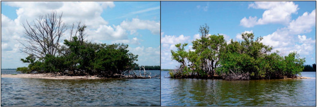
Figure 1. The two islands used for this experiment, SL1B (left) and SL13C (right). Photographed on 13 August 2018 by NCH.

establish sympatric populations on each island. These lizards came from larger, nearby islands where both species were relatively abundant (SL12: 27°29'55"N, 80°19'46"W; SL3: 27°32'07"N, 80°20'20"W; IR11: 27°48'01"N, 80°27'12"W), with each experimental island receiving a mix of individuals from each source island. Green anoles from our source populations have lived in sympatry with brown anoles for at least 25 generations (Campbell, 2000).