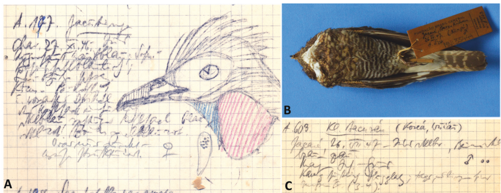
Figure 3. Examples of Helmut Sick's diary entries for specimens collected during the Expedição Roncador-Xingú-Tapajós: (A) Aburria mattereri , A.197 (field number), bird from Chavantina, currently at Museu de Zoologia, Universidade de São Paulo, with detailed drawing of bare parts, gonads and other information usually not recorded on the specimen labels; (B–C) specimen MN35444 Chordeiles pusillus , A.603 (field number), and entry and more detailed information in the diary.

It is worth stressing the importance of the field numbers to these specimens. Helmut Sick and his assistants were punctilious, and practically every specimen has much more complete data in the original field diaries than were noted on the labels (Fig. 3).