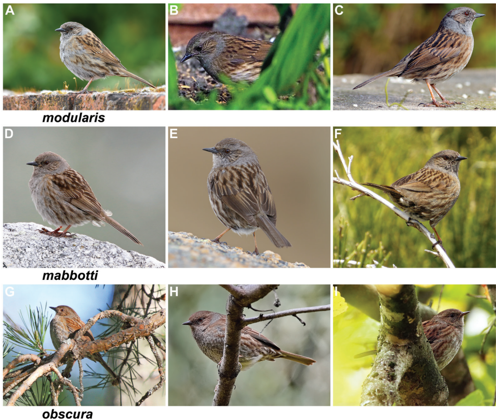
Figure 2. Individuals of the three Dunnock taxa considered herein. A. Prunella [modularis] modularis, UK. B. P. [m.] modularis, Ireland. C. P. [m.] modularis, UK. D. P. [m.] mabbotti, Spain. E. P. [m.] mabbotti, Spain. F. P. [m.] mabbotti, Spain. G. P. [m.] obscura, Armenia. H. P. [m.] obscura, Georgia. I. P. [m.] obscura, Iran

are therefore in breeding plumage. We also provide pictures of live individuals of the same taxa, photographed in the breeding season (Fig. 2).