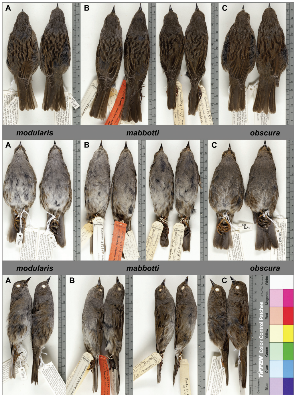
Figure 1. Specimens of the three Dunnock taxa considered in this work in dorsal, ventral and lateral views. A. Prunella [modularis] modularis , USNM 640862 (female; left) and USNM 640847 (male; right), Greece. B. P. [m.] mabbotti , first pair USNM 256648 (female; left) and USNM 256755 (type specimen, male; right), French Pyrenees; second pair USNM 317499 (female; left), and USNM 317500 (male; right), Spain. C. P. [m.] obscura , USNM 640349 (female; left) and USNM 640358 (male; right), Greater Caucasus (S. V. Drovetski)