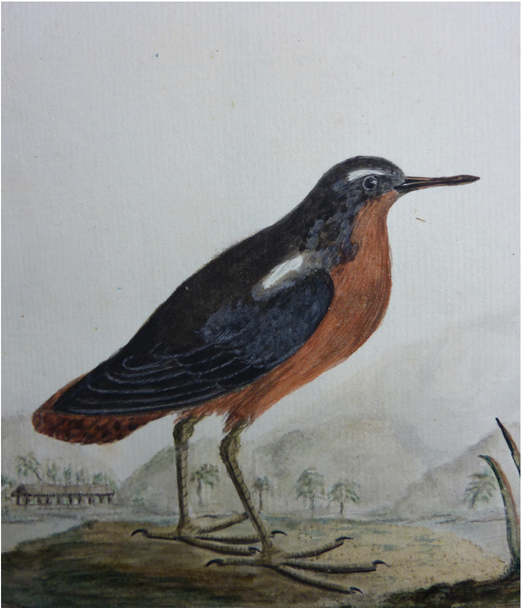
Figure 6. Tahiti Sandpiper Prosobonia leucoptera , from the Latham MS collection; note the all-rufous tail. The plate is unsigned and by an unknown artist; it is annotated with a cross-reference to the description in Latham (1824: 296) and appears to be a copy of Forster's plate (Fig. 1), albeit with some differences, e.g., tail length, posture, bill length and leg colour. Latham's 888 original illustrations of birds in six volumes were acquired by the British Museum from Mrs E. Wickham on 24 November 1920 and are now at the Natural History Museum (NHMUK) (Latham n.d., Sawyer 1949, Jackson 1999, Jackson et al. 2013).

We consider the differences between Moorea and Tahiti birds to represent age, sex, season or inter-island variation, rather than evidence of a separate taxon. It is possible that future work testing ancient DNA of archaeological remains on Moorea may resolve this issue, but until then we conclude that Prosobonia ellisi Sharpe, 1906b, is a junior synonym of Tringa leucoptera J. F. Gmelin, 1789.