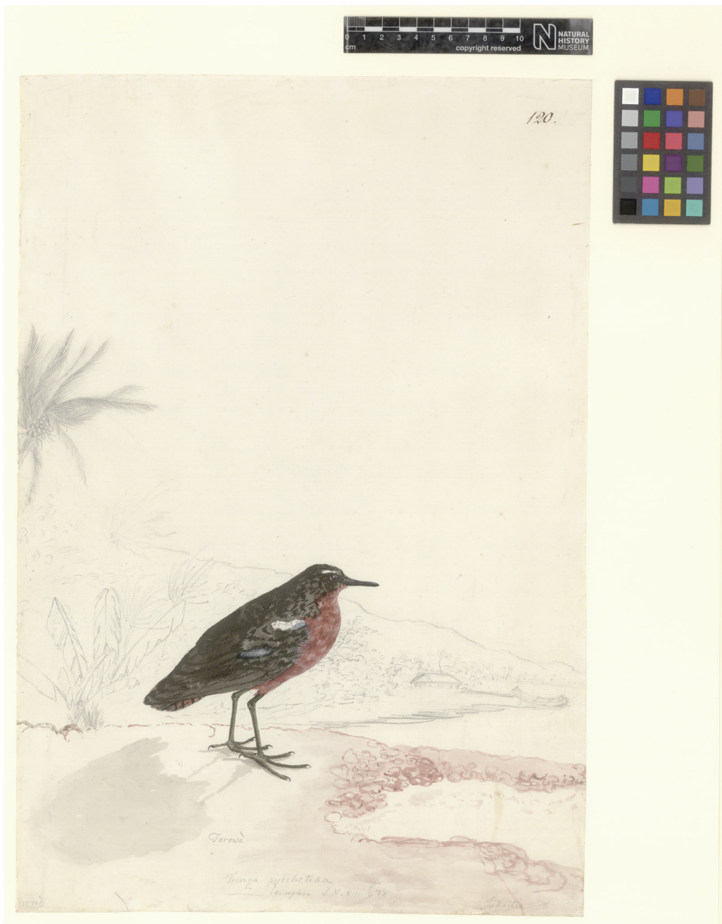
Figure 1. Tahiti Sandpiper Prosobonia leucoptera , Tahiti, August 1774 or April/May 1774; the bird shows at least two groups of white wing feathers (Georg Forster, © Natural History Museum, London)

Ellis' illustration as differing from that by Forster in having a circling of rufous around the eye; a double patch of white on the wing-coverts, and the median and greater wing-coverts pale ferruginous, like the rump. However, the Webber illustration, also made on Moorea (Fig. 3), was not mentioned by Sharpe (1906a,b). According to Walters (1991), the Ellis (Fig. 2) and Webber (Fig. 3) depictions are of the same species. However, they differ in at least