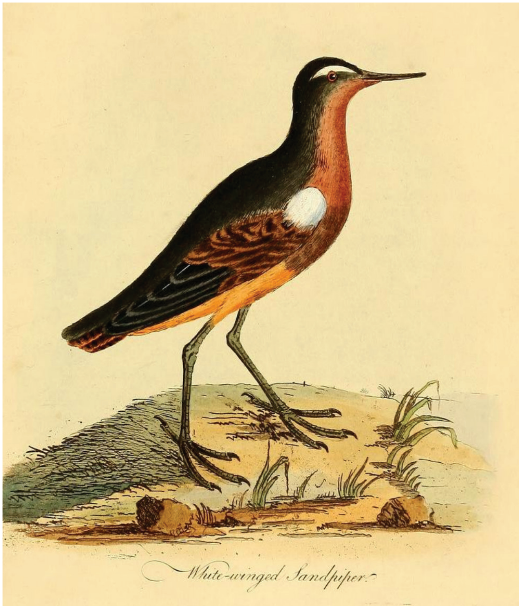
Figure 5. Tahiti Sandpiper Prosobonia leucoptera , from Latham (1824); note the white supercilium, rufous wing-coverts, and pale belly and undertail-coverts. Latham added a plate to his first publication (Latham 1785: 172–173, pl. LXXXII) and reused it in 1824 (Latham 1824: 296, pl. CLII). The plates differ notably in, for example, the supercilium, breast and undertail colorations (see Figs. 4–5) (both volumes on the Biodiversity Library are held in the Smithsonian Library). These differences may be attributable to the colourists who worked on the relevant copies during the publication process.

do known illustrations of the sole Tahiti Sandpiper specimen in Joseph Banks' collection (Figs. 4–6). It is very unlikely that birds from Moorea were morphologically distinct from those on Tahiti (as these islands are separated by just 18 km). Also, there is evidence of individuals exhibiting patchy white feathers in several Polynesian Acrocephalus warblers (Thibault & Cibois 2017), which could be evidence of a limited gene pool and explain the minor variation in the meagre sample of sandpipers.