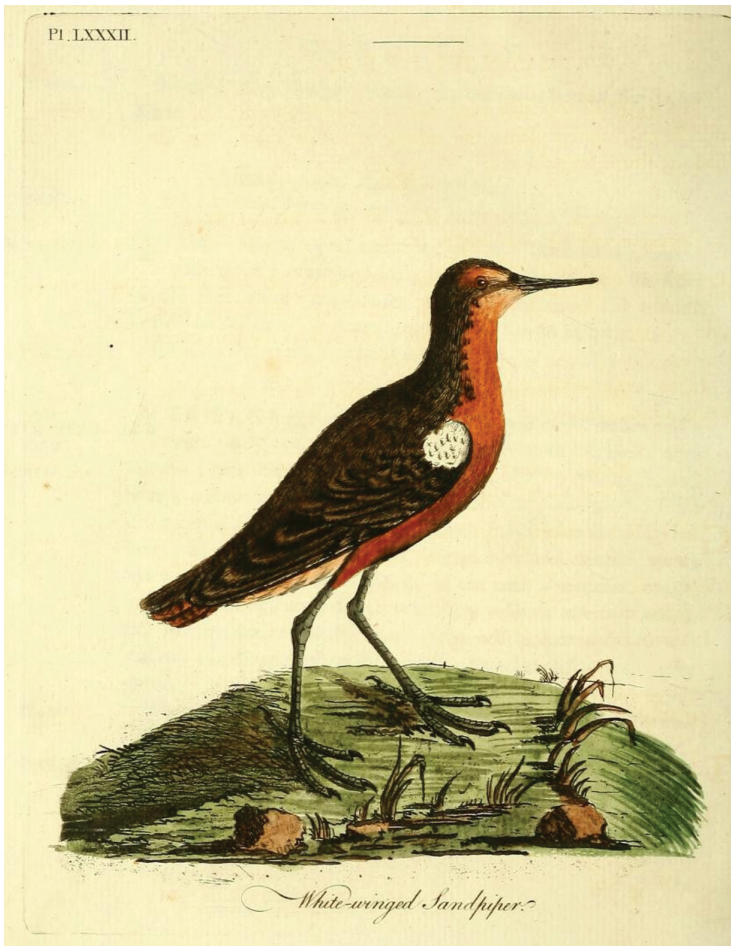
Figure 4. Tahiti Sandpiper Prosobonia leucoptera , from Latham (1785); note the pale undertail-coverts and rufous supercilium