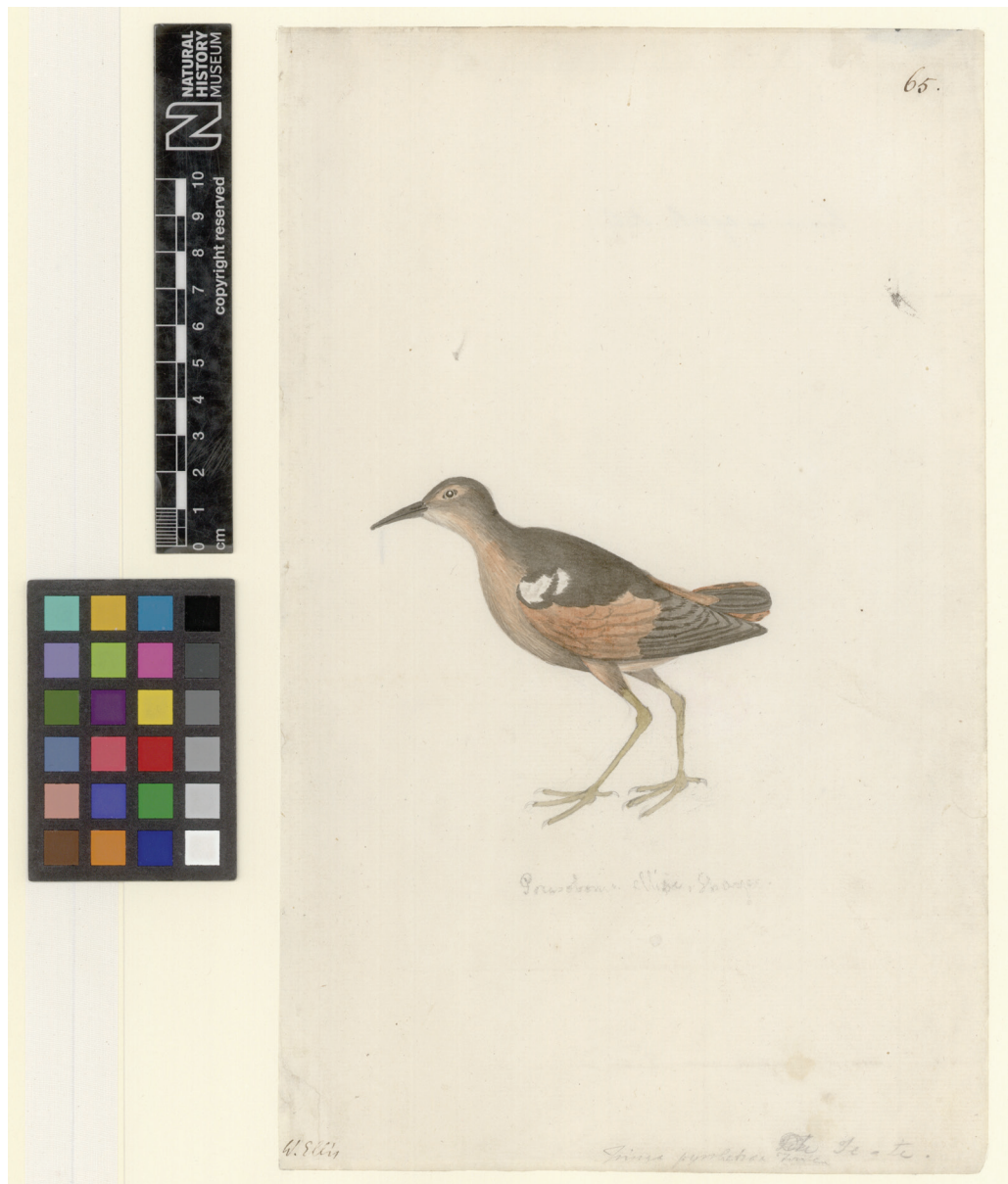
Figure 2. Moorea Sandpiper Prosobonia ellisi , Moorea, August–December 1777; the claws are not coloured, indicating that the illustration was unfinished, and the annotation Prosobonia ellisi was added by Sawyer (Sawyer 1949) (William Wade Ellis, © Natural History Museum, London)

ten points: bill shape and thickness, ear patch colour, throat colour, tibia feathering, tail pattern, wing-coverts pattern, tail and wing lengths, and leg and underparts colorations. The Webber illustration differs in having a supercilium (absent in Ellis'), only a single patch of white on the wing-coverts (not two), and differently patterned median and greater coverts. The rump is ferruginous, but the same feature is present on the surviving specimen (Jansen et al. 2021).