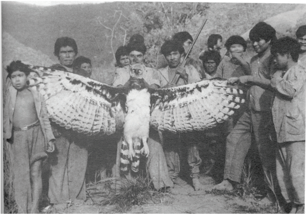
Figure 4. Photograph taken by Hermano Ginés during an expedition of the Sociedad de Ciencias Naturales La Salle to the Sierra de Perijá (at the western border of the Lake Maracaibo basin, c.1947–51), showing a group of natives (Yukpa) from the Atapsi River valley holding a recently shot adult Harpy Eagle Harpia harpyja (from Hoyos 1988, with permission)

taken of live birds by PAB, who has measured 47 Harpy (mean 8.6 cm for n = 20 males; 12.3 cm for n = 27 females) and 12 Crested Eagles (mean 3.5 cm for n = 5 males; mean 4.8 cm for n = 7 females).