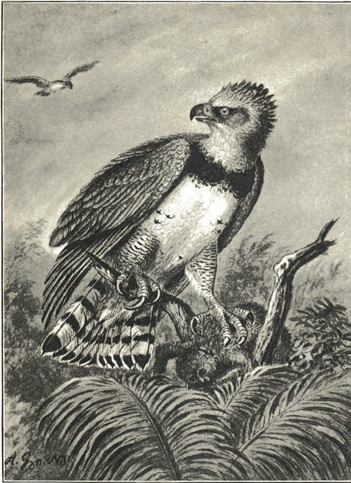
Figure 2. Lithograph of a Harpy Eagle Harpia harpyja from the lowland forest of the southern Lake Maracaibo basin, based on a painting by Anton Goering (Goering 1893).

Further documentary research has also yielded an impressive photograph of a group of Yukpa natives from the middle río Atapsi on the east slopes of the Sierra de Perijá (c.800–1,300 m, at the western border of the Lake Maracaibo basin) holding a dead Harpy Eagle (Fig. 4). It was taken by H. Ginés during an expedition of the Sociedad de Ciencias Naturales La Salle to these remote mountains, sometime during 1947–51 (Hoyos 1988). It is somewhat puzzling, however, that as Ginés was an ornithologist he did not mention the species in his comprehensive, annotated list of birds of the Perijá Mountains (Ginés et al. 1953).