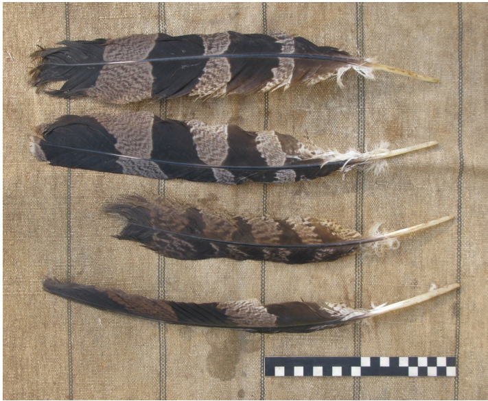
Figure 5. Top to bottom: two fresh rectrices of Harpy Eagle Harpia harpyja , a smaller worn tail feather or secondary of a Harpy or Crested Eagle Morphnus guianensis , and a Harpy Eagle primary (P. W. Trail in litt. to CJS, September 2016). These are from at least one or more large eagles taken by Barí people in the headwaters of the río del Norte, south of the village of Saimadoyi, in the Sierra de Perijá, Venezuela, August 1994.

Serranía de Abusanqui, a few km west of his house. Identification in this case was based on standard ethnozoological methods, in which the witness determined the species concerned using an illustrated field guide.