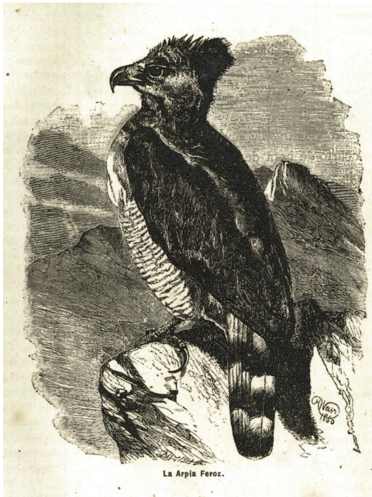
Figure 1. Engraving by an unknown artist, illustrating an article by Eduardo López Rivas about an encounter with a Harpy Eagle Harpia harpyja in western Venezuela (from El Zulia Ilustrado , Maracaibo 1889). The specimen depicted might represent a juvenile Harpy Eagle or possibly that of a Crested Eagle Morphnus guianensis , a species also found in the region.

saw in the heights, describing circles in the air, a Harpya destructor [sic], the most powerful eagle of South America. This majestic bird that surpasses our Royal Eagle [= Golden Eagle Aquila chrysaetos ] in size, first seemed to me to be sighting a prey; however it later dropped, perching on a bare branch of a gigantic tree; I took advantage of the fortunate moment to observe as I pleased with my field glasses as if it were in front of me, its position and movements. Not long afterwards it lifted off again and disappeared in the thick vegetation'. In this case the behaviour described does not fully accord with that of Harpy Eagle. Goering perhaps misidentified a Crested Eagle, another very large predator, which does routinely soar and has a similar juvenile plumage. It is even rarer in the Lake Maracaibo basin, having only been documented on the east side in 2017 (eBird 2020). This is not unlikely, even if Goering was reputedly well acquainted with birds; he was a professional collector for European museums and menageries, a taxidermist and world-famous natural history illustrator. His narrative is illustrated with a lithograph clearly representing a Harpy Eagle based on his own painting (Goering 1893: 25; Fig. 2).