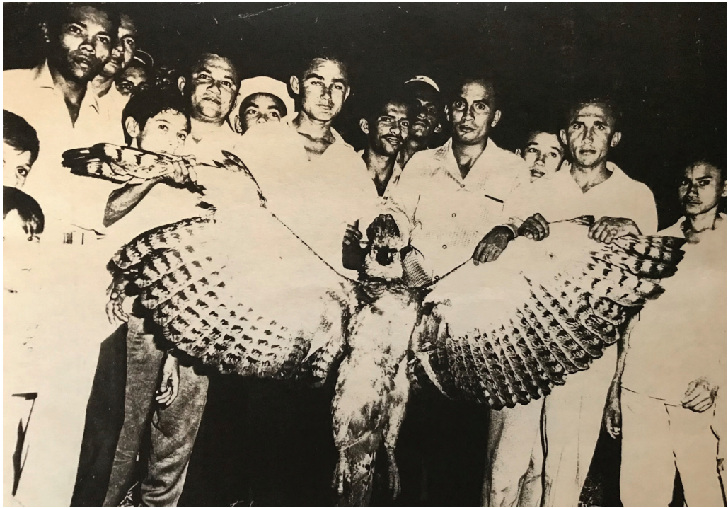
Figure 3. Photograph taken by an officer of the Venezuelan Ministerio de Agricultura y Cría in the airport of Santa Bárbara del Zulia (1959). Local people holding a recently shot grown juvenile Harpy Eagle Harpia harpyja

that of Crested Eagle (e.g., diameter 220 cm, depth 42 cm, branch thickness 3.5 cm, usually sited in secondary forks; PAB unpubl.). Associated with this nest were bones of several mammal species: White-fronted Capuchin Cebus albifrons (one skull), Venezuelan Red Howler Alouatta seniculus (one skull each of a juvenile and an adult), Northern Tamandua Tamandua mexicana (one skull), Hoffmann's Two-toed Sloth Choloepus hoffmanni (two skulls, three humeri, two femurs); and the pelvic girdle of a large bird, possibly a Yellow-knobbed Curassow Crax daubentoni .