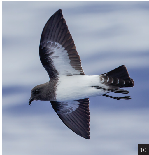
Figures 7–10. ‘Classic’ Titan Storm Petrels Fregetta [grallaria] titan , Rapa Island, Austral Islands, French Polynesia, November–December 2019. The plumage of ‘classic’ titan includes broad white fringes to the scapulars, mantle to rump, and upperwing greater, median and longest lesser secondary-coverts. Fig. 7 offers a closer look at the broad white fringes to the mantle to rump feathers, which are abraded and worn off on a few old, browner feathers. The bird in Fig. 8 has undergone head and body moult, with blackish-grey scapulars and mantle to rump, strongly contrasting with the mainly old, browner upperwing-coverts without white fringes. Note the sparse dark streaking on the body-sides in Fig. 8, but lacking in Fig. 10.

occur/s in East Polynesia away from Rapa and Marotiri, but Titan Storm Petrel apparently disperses a significant distance given these two records from much further north and east.