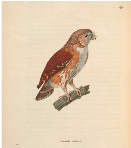
Figure 2 (above left). The illustration published by Levaillant (1799).