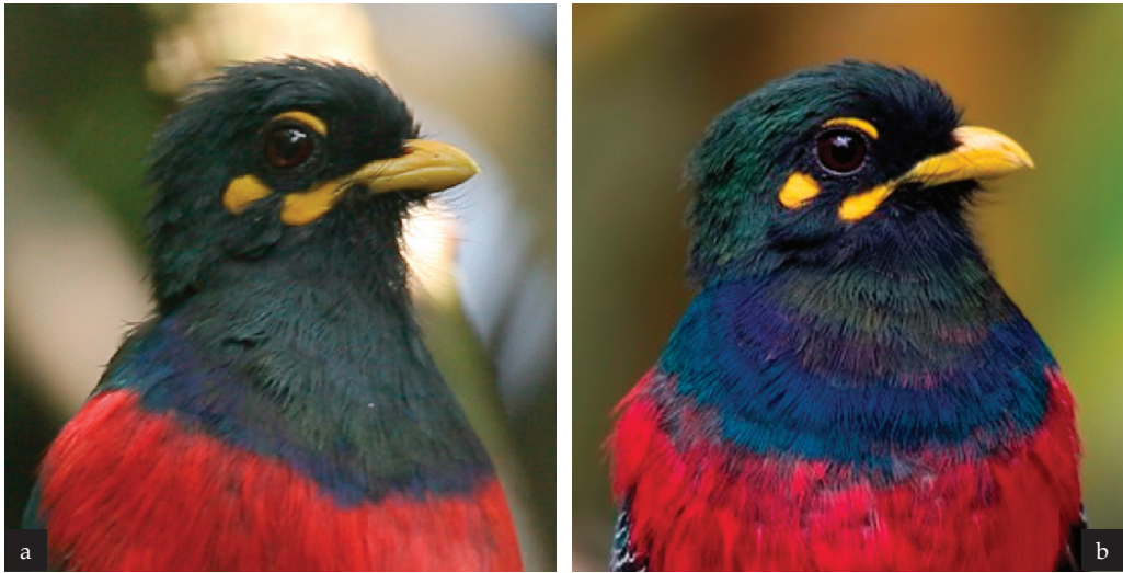
Figure 3. Bill colour and bare facial skin in male Bar-tailed Trogons Apaloderma vittatum , (a) Obudu Plateau, Nigeria, December 2004, (b) Bioko, February 2019

chin to mid-belly and hence slightly smaller pink belly patches than Central and Western females (Table 1). Eastern birds have longer wings and tails than Central birds, which in turn have longer wings and tails than Western birds (Table 1). It is curious that Central birds have slightly shorter bills than Eastern and Western birds; the fact that both sexes show this suggests the difference is real. It is also curious that in many photographs Eastern birds appear to have smaller bills than either Central or Western birds; this seems to be the product of the latter having less feathering at the base of the mandible.