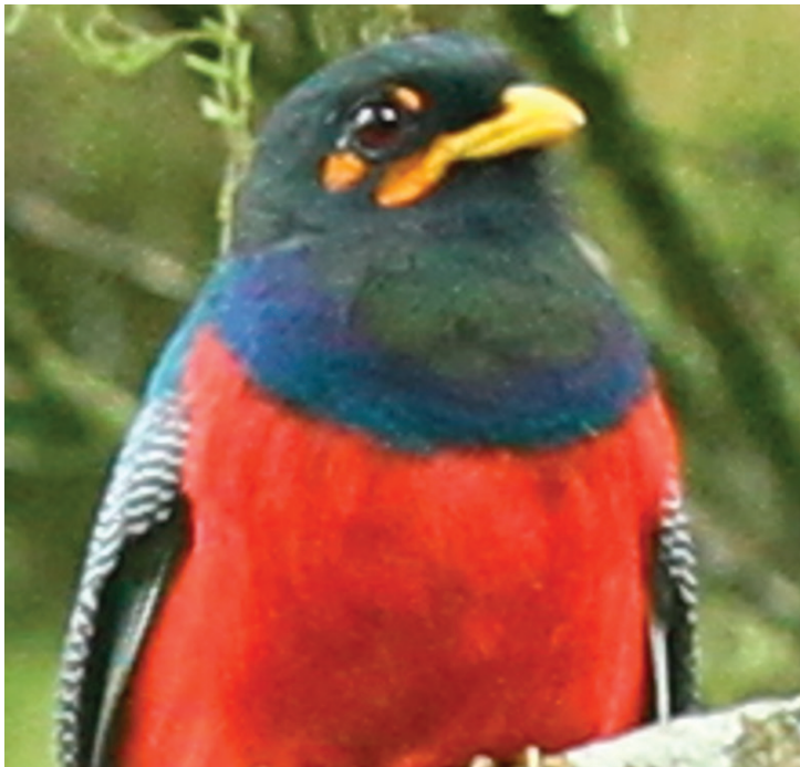
Figure 4. Male Bar-tailed Trogon Apaloderma vittatum showing yellow supraocular mark (spot or line?), Buhoma, Uganda, October 2013

chin to mid-belly and hence slightly smaller pink belly patches than Central and Western females (Table 1). Eastern birds have longer wings and tails than Central birds, which in turn have longer wings and tails than Western birds (Table 1). It is curious that Central birds have slightly shorter bills than Eastern and Western birds; the fact that both sexes show this suggests the difference is real. It is also curious that in many photographs Eastern birds appear to have smaller bills than either Central or Western birds; this seems to be the product of the latter having less feathering at the base of the mandible.