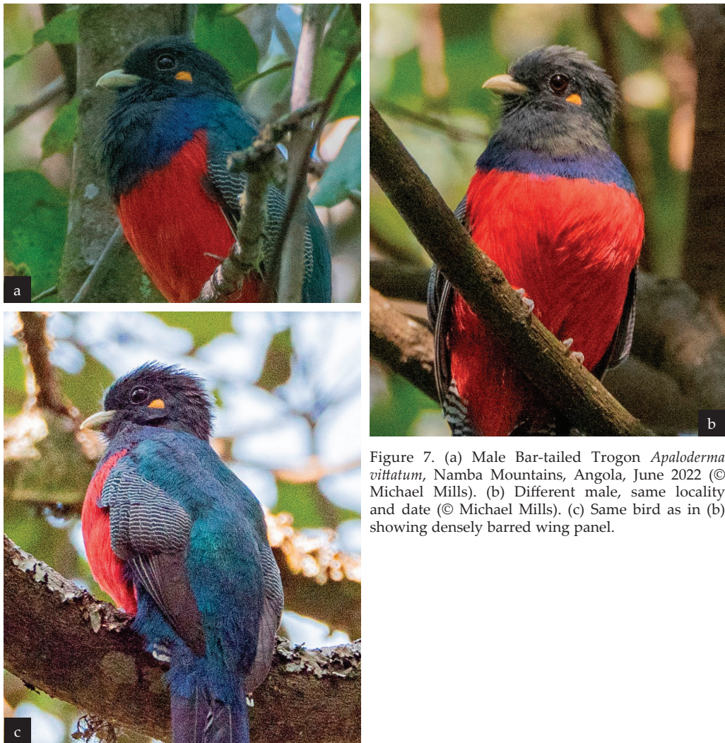
Figure 7. (a) Male Bar-tailed Trogon Apaloderma vittatum , Namba Mountains, Angola, June 2022 (© Michael Mills). (b) Different male, same locality and date (© Michael Mills). (c) Same bird as in (b) showing densely barred wing panel.

Eastern birds exceeds the Tobias threshold for species rank, and we are strongly inclined to judge such elevation appropriate. Given that the Tobias criteria consider ‘a pronounced difference in body part colour’ a major distinction and therefore worthy of a score of 3, our scoring of the bill difference is, arguably, conservative, but it pays respect to the somewhat anomalous description of the bill of Eastern birds in Mozambique as ‘pale aureolin-yellow, slightly pale greenish in tinge’ (Vincent 1935); indeed, there is a degree of variation in bill colour in the photographs used herein, although this may be in part an effect of light (the bird in Fig. 7b and 7c is the same yet the bill colour is a shade yellower in 7b). Certainly, however, the facial appearance that results from the combination of yellow bill and gape-line, when set beside the greenish-white bill on a plainer head, is very striking and can surely be construed as a signal that would form a strong disincentive to hybridisation if populations were ever to meet. (It bears mention that Central and Western females also possess a bare gape-line.)