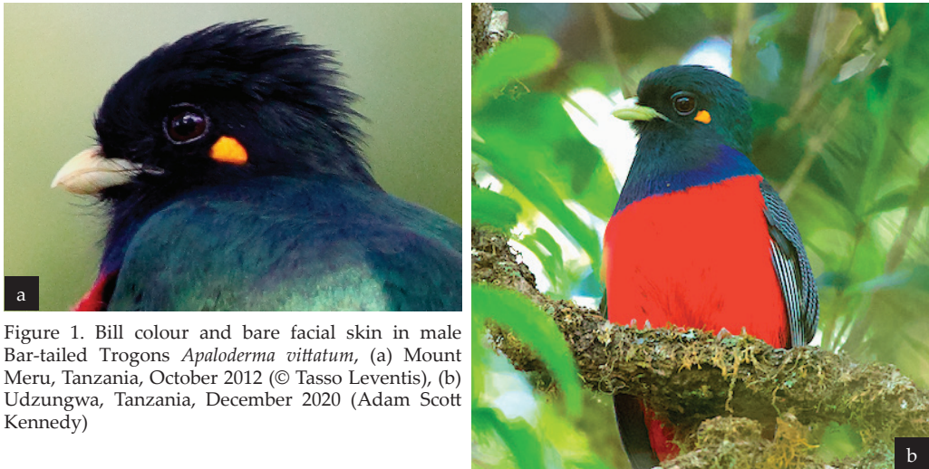
Figure 1. Bill colour and bare facial skin in male Bar-tailed Trogons Apaloderma vittatum , (a) Mount Meru, Tanzania, October 2012, (b) Udzungwa, Tanzania, December 2020

when the light in the photograph shows the colour fully (Fig. 2a,b); four of the five other photographs showed neither ear spot nor gape line, while one showed these features and a yellow supraocular mark (see Discussion and Fig. 4). In seven of eight photographs (88%),