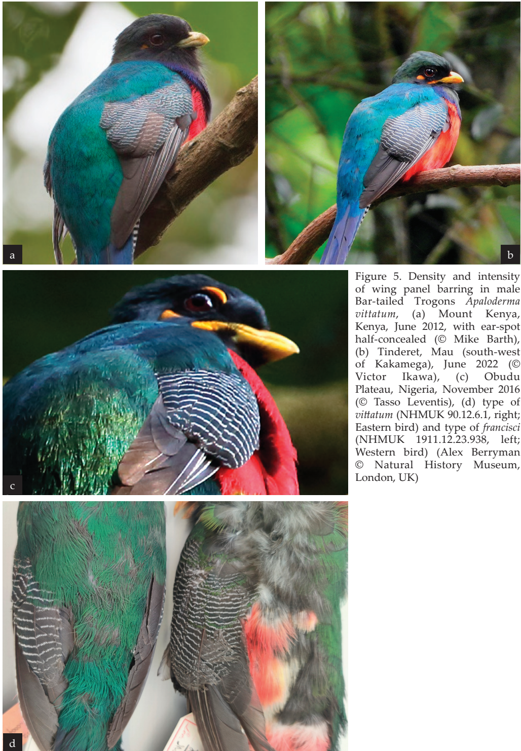
Figure 5. Density and intensity of wing panel barring in male Bar-tailed Trogons Apaloderma vittatum, (a) Mount Kenya, Kenya, June 2012, with ear-spot half-concealed, (b) Tinderet, Mau (south-west of Kakamega), June 2022, (c) Obudu Plateau, Nigeria, November 2016, (d) type of vittatum (NHMUK 90.12.6.1, right; Eastern bird) and type of francisci (NHMUK 1911.12.23.938, left; Western bird)