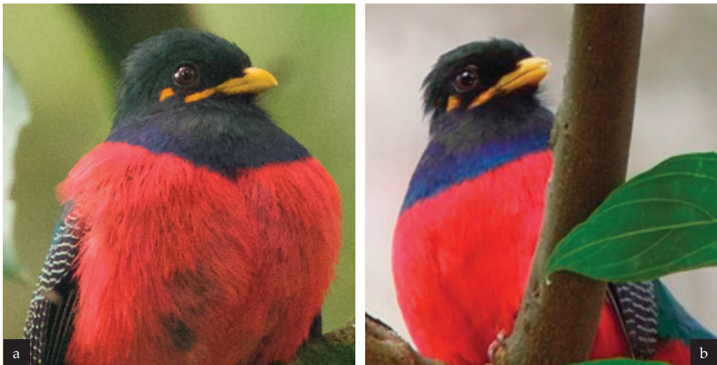
Figure 2. Bill colour and bare facial skin in male Bar-tailed Trogons Apaloderma vittatum , (a) Nyungwe, Rwanda, July 2019, (b) Kakamega Forest, Kenya, August 2015

Western males showed a golden-yellow bill, an orange ear spot and gape line, and a narrow orange-yellow upper eyeline (Fig. 3a,b); one photograph is too distant and grainy to be sure of the upper eyeline.