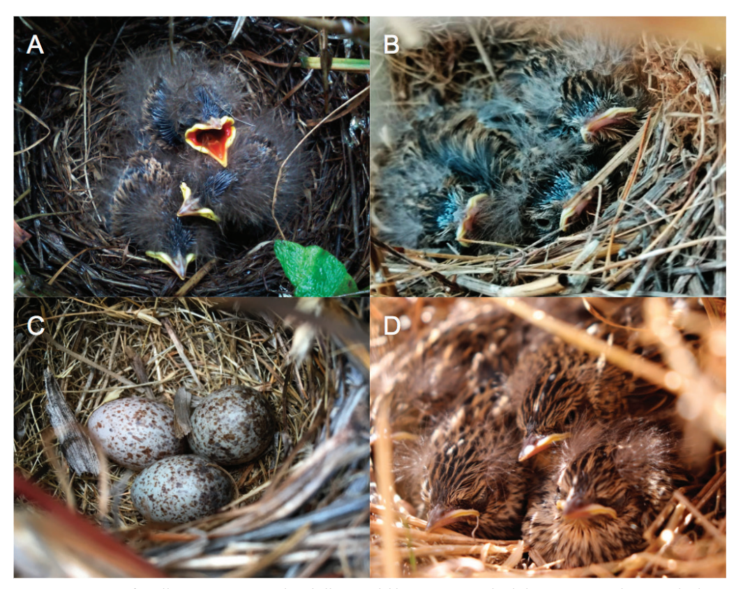
Figure 2. Nests of Hellmayr's Pipit Anthus hellmayri dabbenei in central Chile: (A) N1, Bulnes, with three nestlings c.8 days old; (B) N2, Los Sauces, with three nestlings c.10 days old; (C) N3, Los Sauces, with three eggs; (D) N4, Los Sauces, with four nestlings c.12 days old

treated these as independent feeding events, whereas calls separated by <5 seconds were considered the same feeding event, as this was the min. interval between deliveries detected using the trail camera.