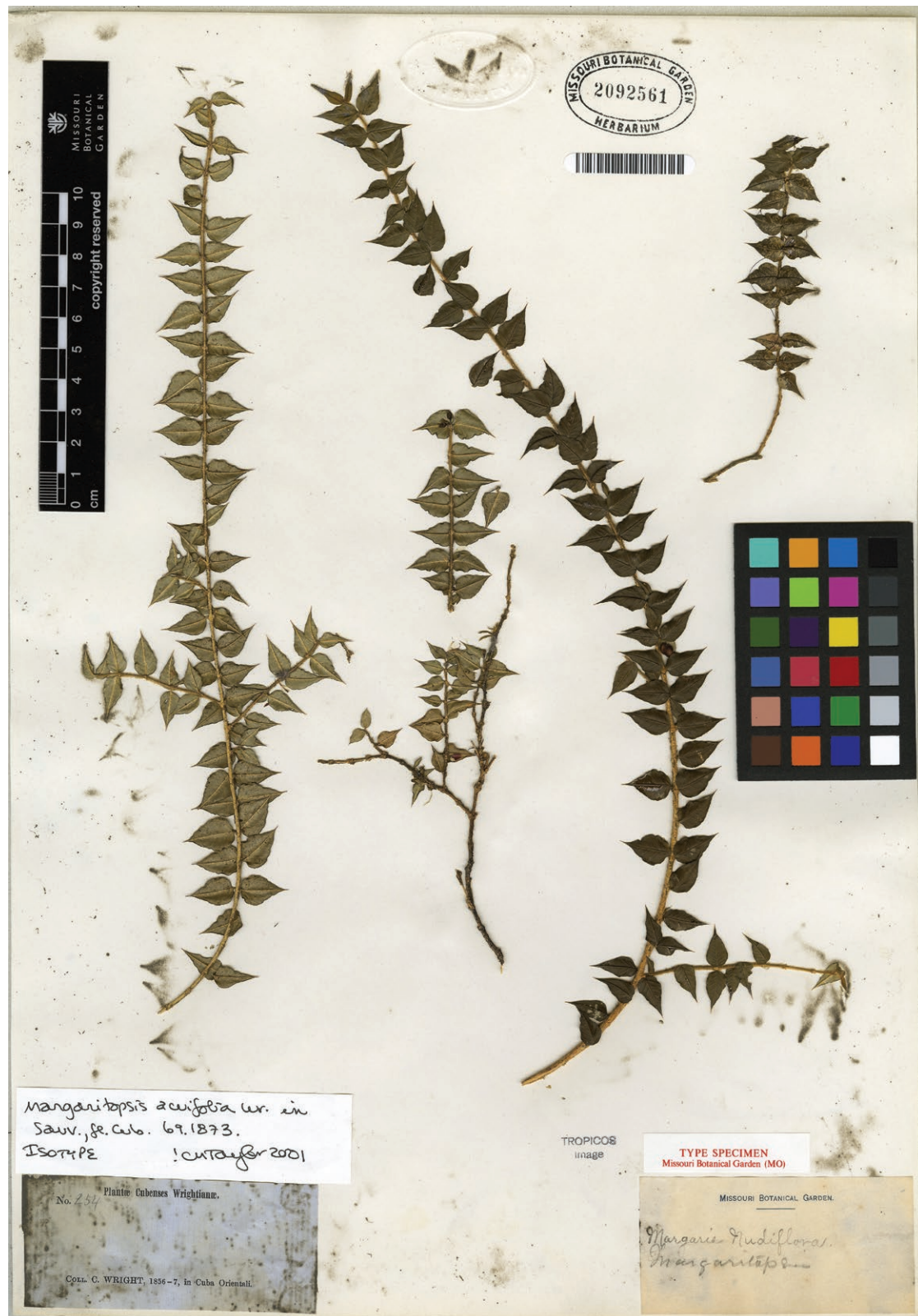
Fig. 2. – Isotype of Eumachia acuífolia (C. Wright) Delprete & J.H. Kirkbr.