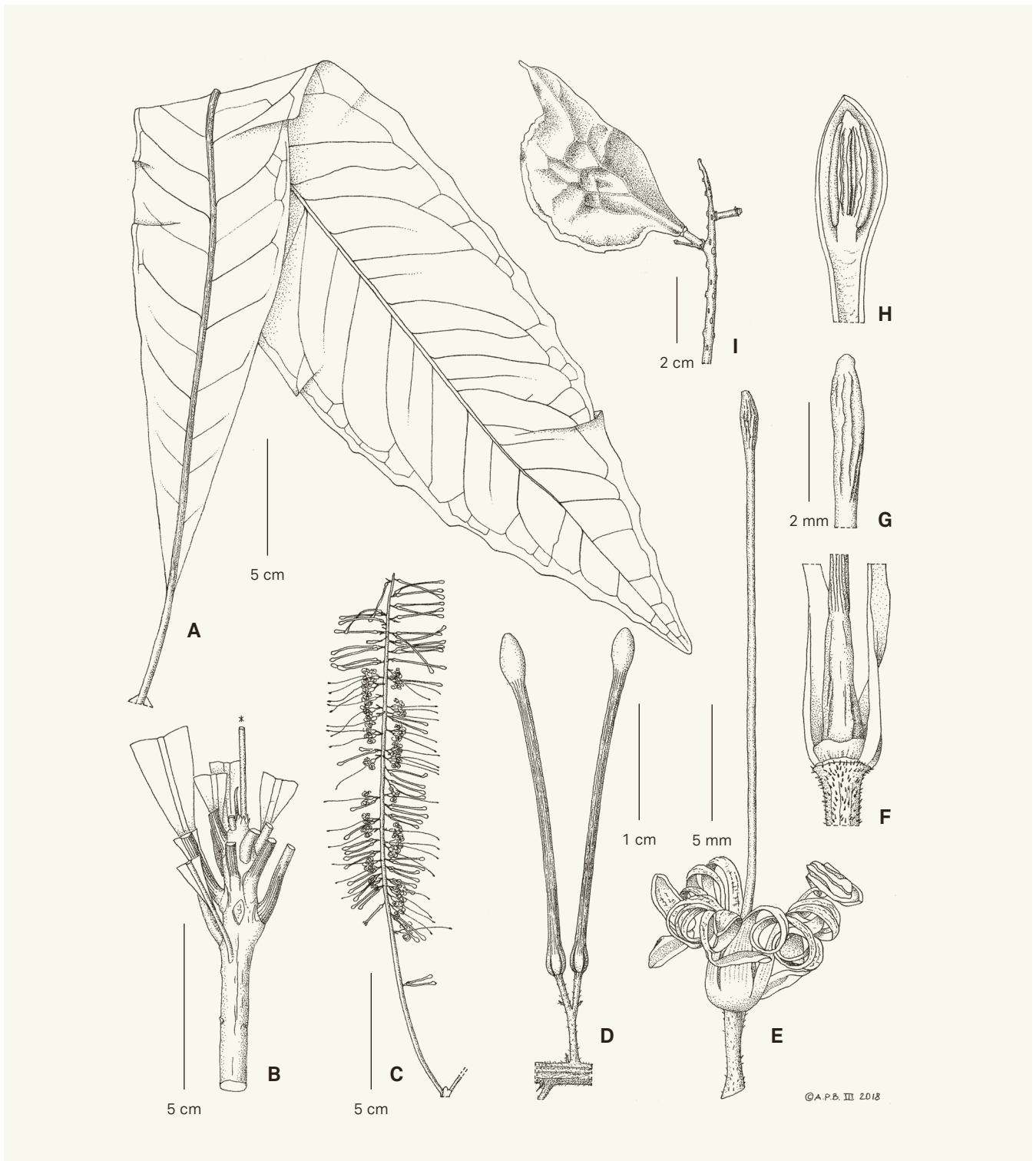
Fig. 1. – Virotia azurea H.C. Hopkins & Pillon. A . Leaf; B . Apex of a shoot showing the arrangement of leaf bases and the base of an inflorescence axis (*); C . Inflorescence (conflorescence), the flowers post-anthesis; D . A flower-pair immediately prior to anthesis, their peduncle subtended by a minute bract and a small bract present at the base of each pedicel; E . A flower post-anthesis, the tepals all helically curled; F . Base of a flower, two tepals removed to show the ovary and the cup-like disc around it; G . Apex of the style, slightly swollen and ridged, forming the pollen presenter; H . Distal part of a tepal, inner surface, with the anther attached; I . Immature fruit, note prominent beak. [A, C, E–H: Gâteblé et al. 87, P; B: Munzinger et al. 1462, P; D: MacKee 15159, P; I: MacKee 46274, P] [Drawing: Andrew Brown]