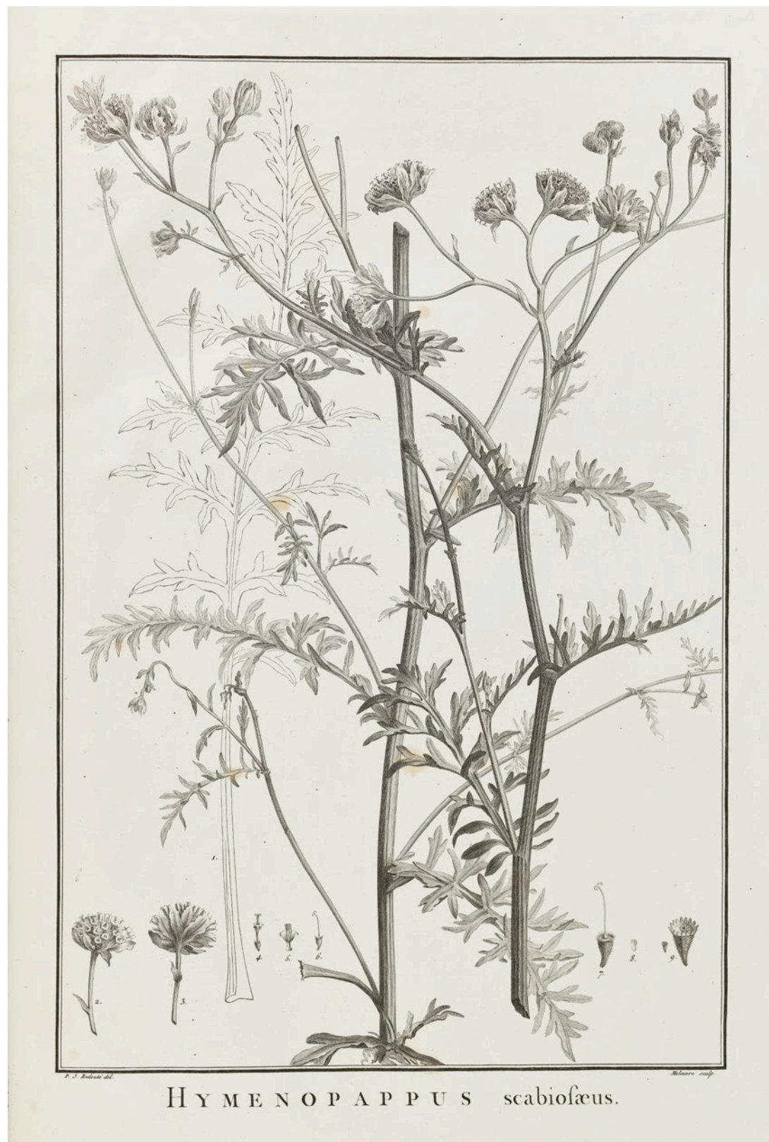
Fig. 2. – Hymenopappus scabiosæus L'Hér. Copper engraving based on P.-J. Redouté, 1788. [ L'Heritier's Reliquiae ]