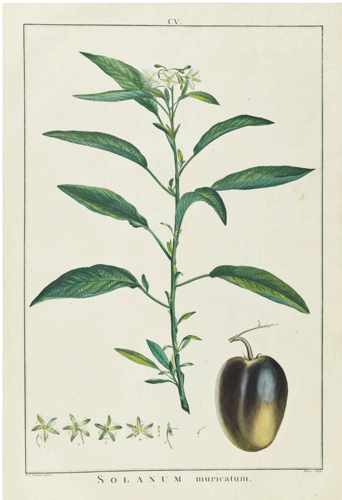
Fig. 3. – Solanum muricatum Ait. Copper engraving based on P.-J. Redouté, no date. [L'Heritier's Reliquiae]