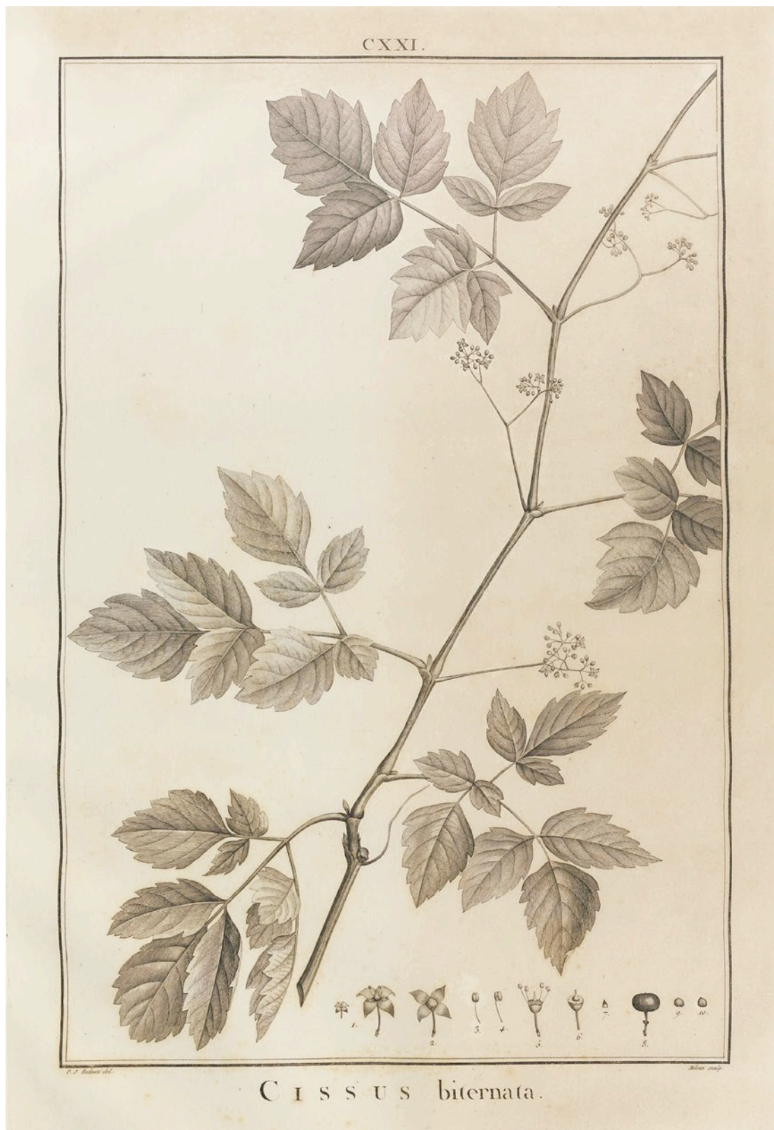
Fig. 9. – Cissus biternata L'Hér. Copper engraving based on P.-J. Redouté, no date. [Tabulae ineditae: tab. 121]