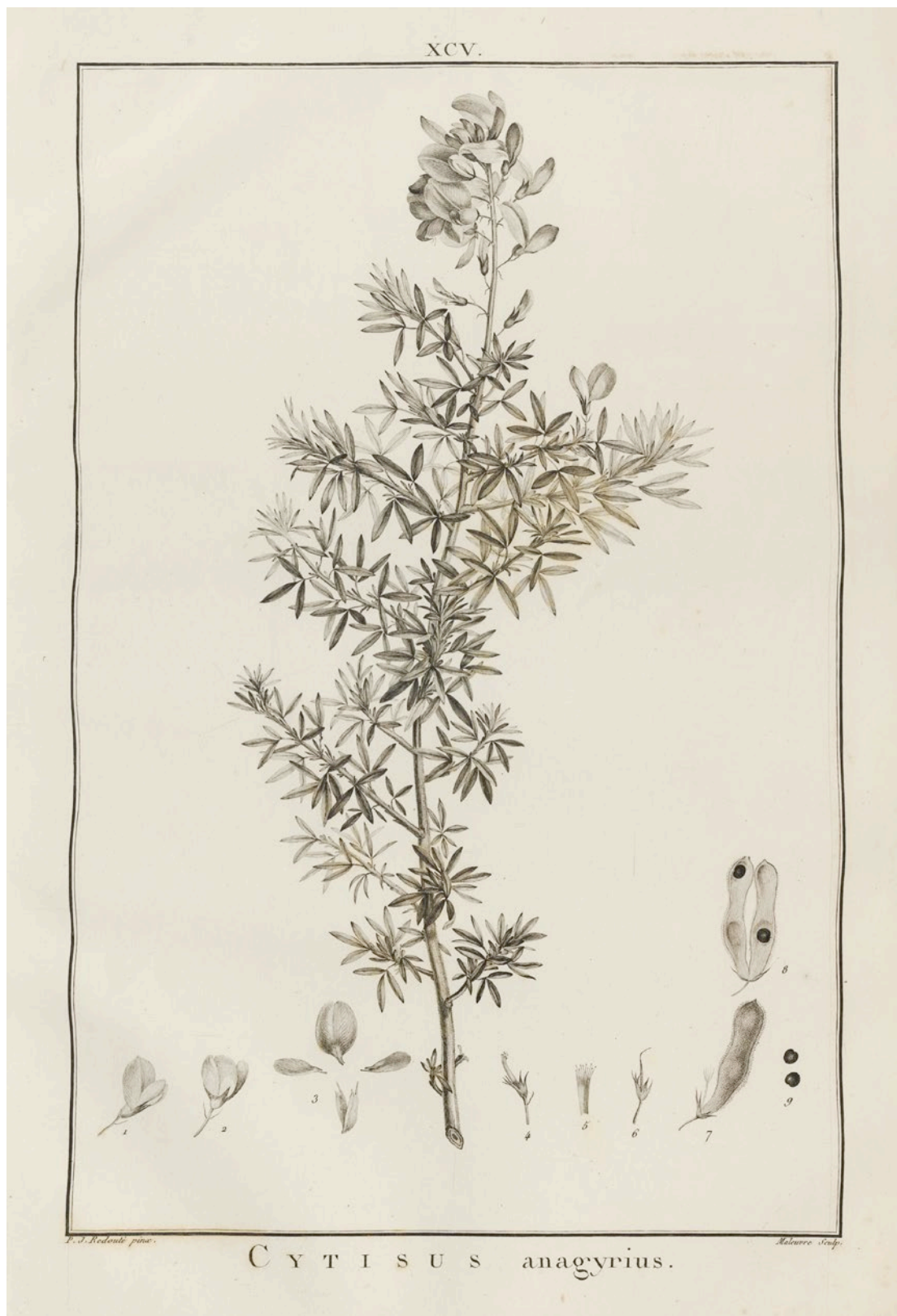
Fig. 5. – Cytisus anagyrius L'Hér. (= Adenocarpus hispanicus (Lam.) DC.). Copper engraving based on P.-J. Redouté, no date. [Tabulae ineditae: tab. 95]