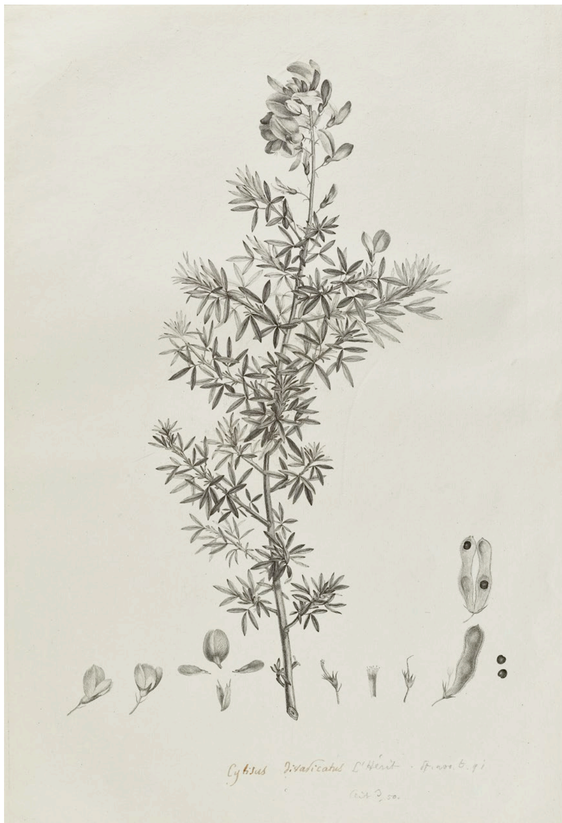
Fig. 4. – Cytisus anagyrius L'Hér. (= Adenocarpus hispanicus (Lam.) DC.). Copper engraving based on P.-J. Redouté, avant la lettre, no date. [L'Heritier's Reliquiae] [Bibliothèque, Conservatoire et Jardin botaniques de Genève]