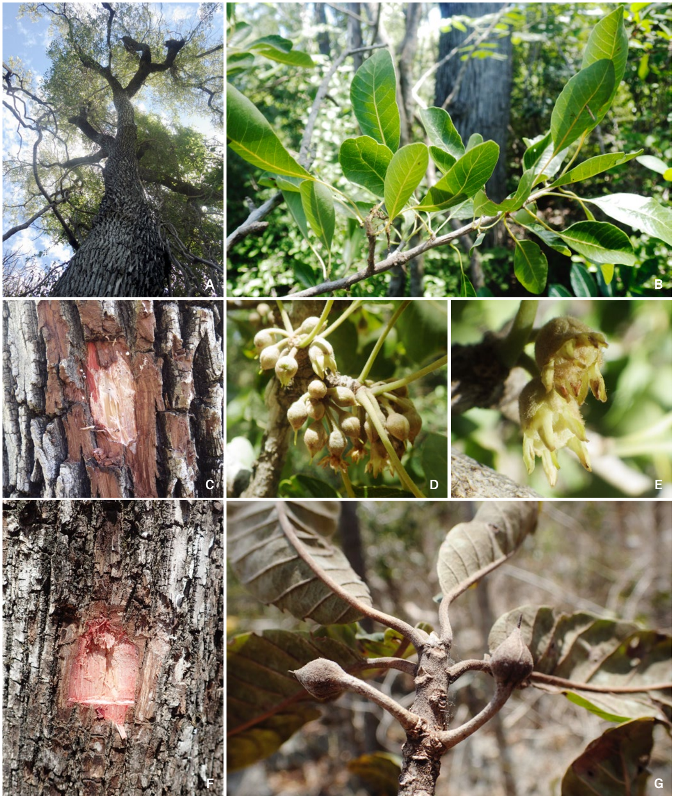
Fig. 2. – Capurodendron miquearum L. Gaut. & Boluda: A. Habit; B. Twig; C. Slashed bark; D. Fascicles of flowers; E. Flowers. Capurodendron namorokense L. Gaut. & Boluda: F. Slashed bark; G. Twig with two old flowers in an early fruit development stage. [A: Gautier 6329; B–E: Gautier 6339; F–G: Gautier et al. 6276]