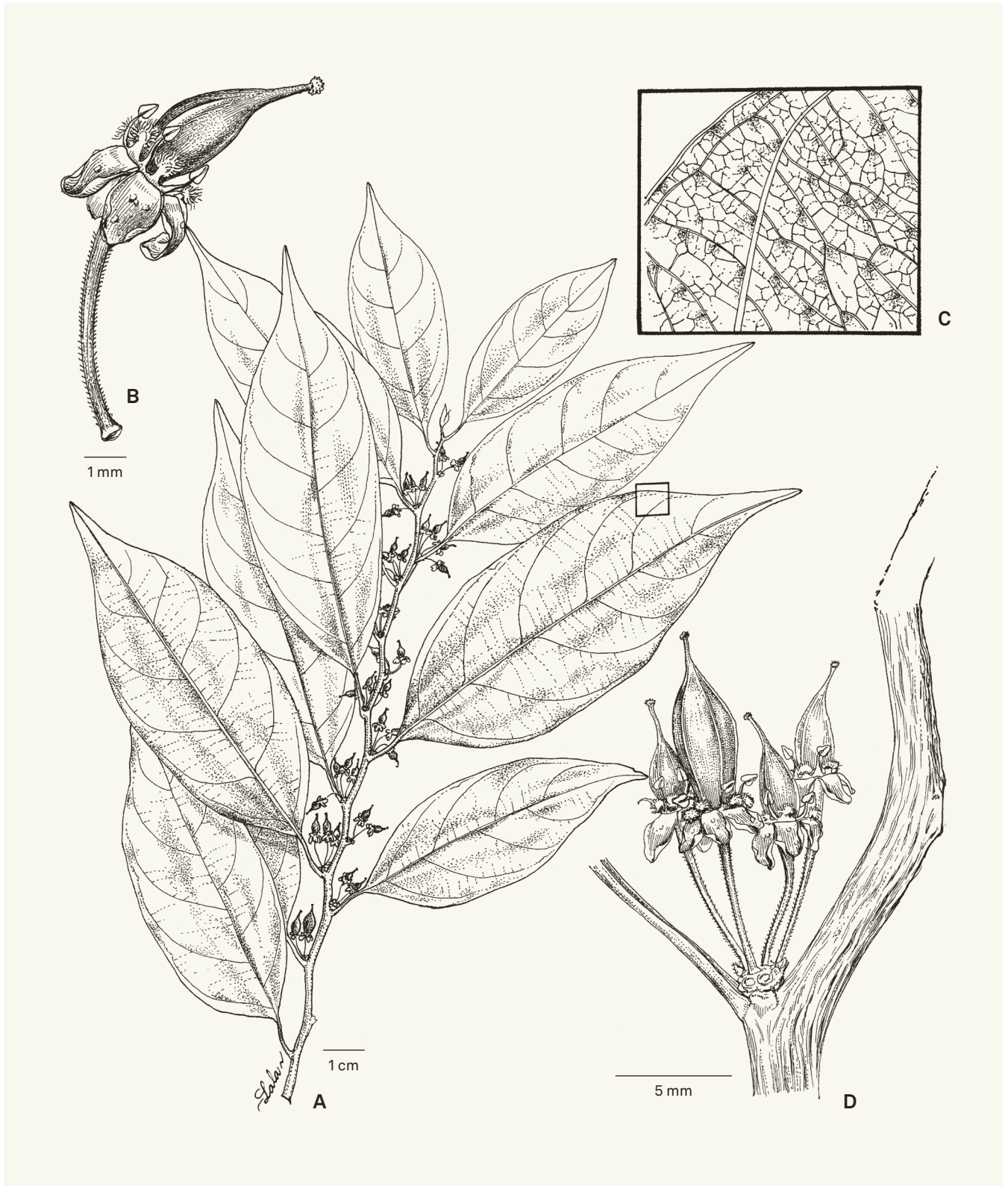
Fig. 1. – Casearia razakamalalae Philpott & Appleq. A. Flowering branch; B. Flower post-anthesis in early fruit development; C. Detail of abaxial leaf surface with conspicuous reticulated higher-order venation; D. Inflorescence. [Razakamalala et al. 5006, TAN] [Drawings: R.L. Andriamiarisoa]