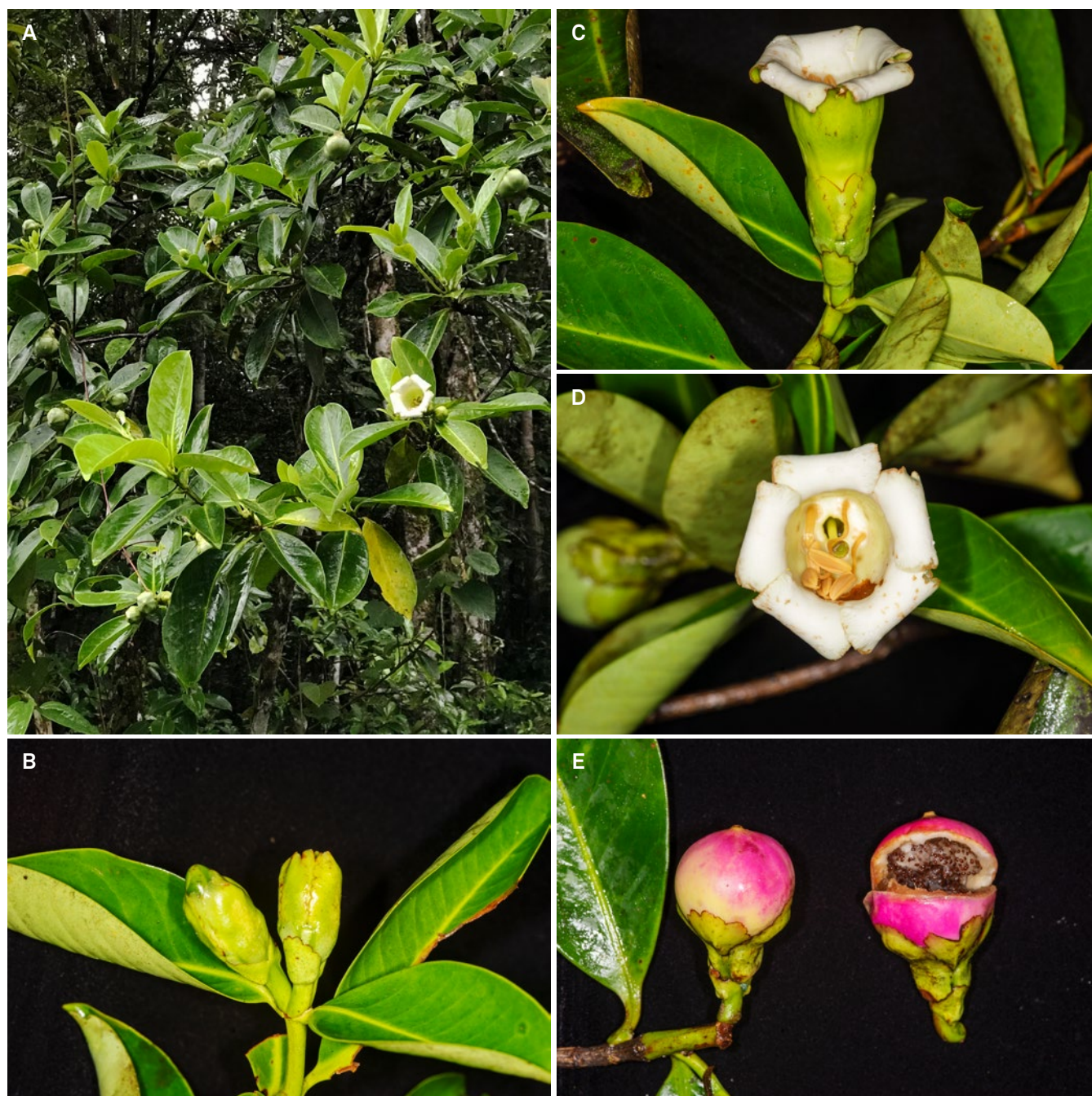
Fig. 3 – Fagraea christinae Y.W. Low & V.A. Albert. A. Habit; B. Close-up of flower buds enclosed by calyx lobes and a pair of bracteoles with distinctive crenate margins; C. Side view of an open flower showing curled corolla lobe margins; D. Top view of an open flower with stamens clearly seen inserted upon a fleshy ring; E. Close-up of pink, mature fruits; fruit on the right artificially cut opened to reveal numerous small and black kidney-shaped seeds.

[A–E: Wanma et al. MAN-SING45]