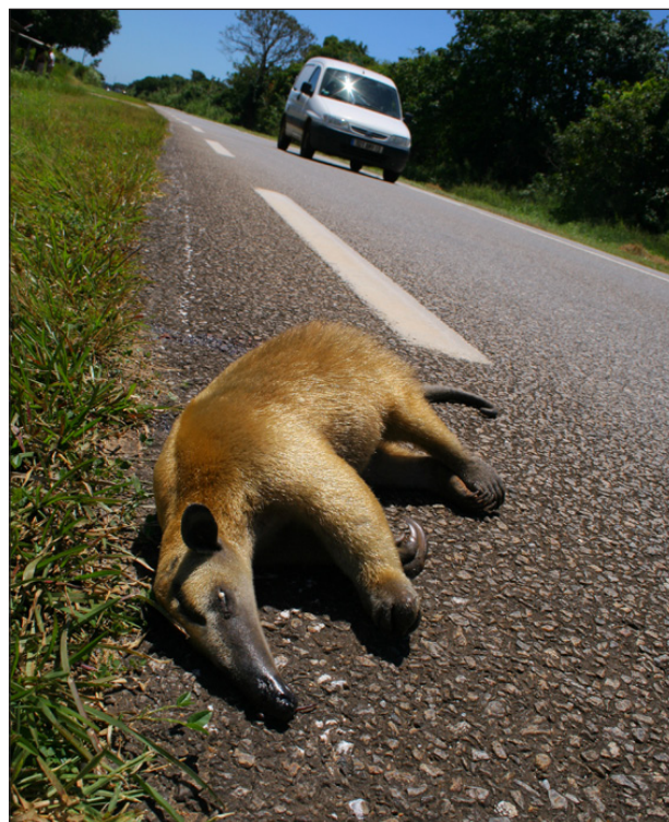
FIGURE 2. Roadkills are rather common along the paved roads in the northern part of French Guiana. of a Tamandua tetradactyla along national road RN1 between Cayenne and Kourou.

According to reported observations in our database, all nine species of xenarthrans have been found as roadkills in French Guiana, but there has been no regular survey for quantifying road mortality. Certainly the most commonly found is Tamandua tetradactyla , which accounts for 14 out of