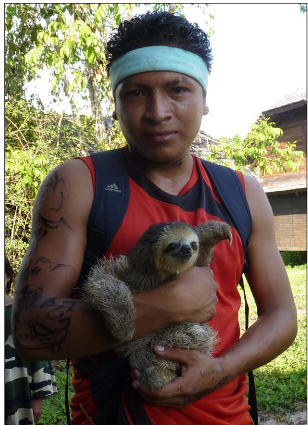
FIGURE 4. A young Bradypus tridactylus kept as a tamed pet by a Wayāpi Amerindian at Trois-Sauts. Photograph by François Catzefflis (November 2010).

Sloths, in their turn, benefit from a very positive value assigned to them in Wayāpi culture. If Bradypus tridactylus is the commonest game sloth in numbers, the two-toed sloths are even more appreciated. Both taxa are regularly kept as pets (FIG. 4),