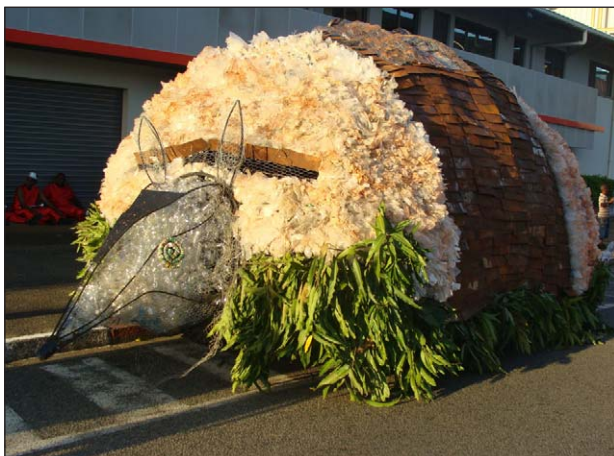
FIGURE 5. A representation of an armadillo at the main Carnival parade in Cayenne, February 2010.

were caught alone with no other conspecific in the immediate vicinity;