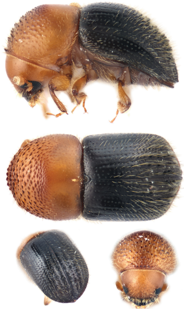
Fig. 2. Holotype of Xylosandrus aurinegro sp. nov. , female, from left to right: lateral view, dorsal view, posterior oblique view of declivity, anterior view of head. Specimen: 2.15 mm.

Head. Frons convex with surface reticulate, sparsely punctured; punctures between eyes with erect setae. Epistoma with dense row of short setae along lower margin. Eyes deeply emarginate, upper portion smaller. Antennal funicle 5-segmented (including pedicel), scape (short and stout) and funicle with scattered hair-like setae of variable size; club obliquely truncate, first segment sclerotized, forming a circular