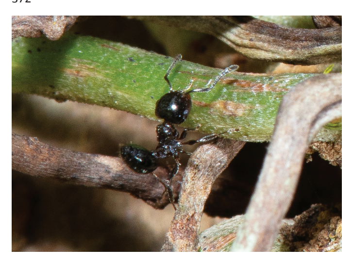
Fig. 3. An individual Crematogaster ashmeadi patrolling the roots of Dendro-phylax lindenii .

a central point beneath the root mass, apparently in a cavity that appeared to have been excavated in the orchid's substrate (Fig. 2). In one case, a spider descended on a bud (Fig. 4) and began affixing a web to the sepals and labellum, possibly lured by the abundance of small prey,