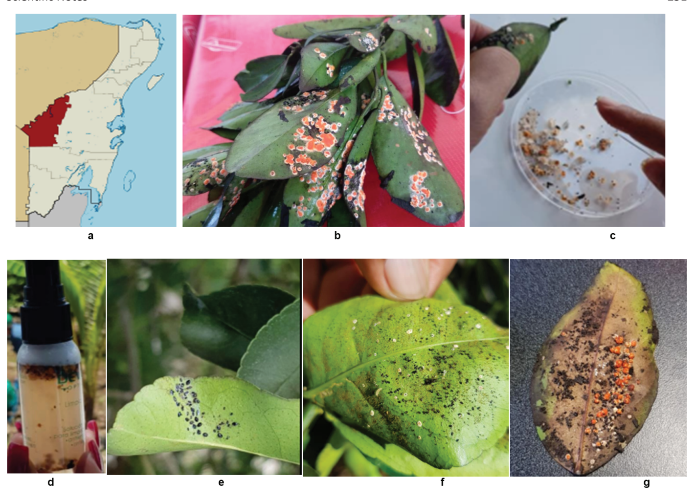
Fig. 1. (a) Aschersonia sp. conidia application site, Jose Maria Morelos, Quintana Roo, Mexico; (b) selection of citrus blackfly nymphs infected with Aschersonia sp. from citrus leaves; (c) conidia extraction with a needle from infected nymphs; (d) conidia suspension; (e) selected citrus leaves with citrus blackfly nymphs uninfected with Aschersonia sp. for conidia application; (f) citrus blackfly nymph infection by Aschersonia sp. and mycelia development after fungus application in 30 leaves infested with citrus blackfly nymphs in Jose Maria Morelos locality at 7 d after application; (g) at about 55 d after application.

Following application of fungal conidia in Aug 2018, citrus blackfly control was achieved by late Sep 2018, about 55 d after application, where fungi were disseminated to other individuals of this species present along untreated shoots (Fig. 1f & 1g). After the application of fungi in 30 ha in Jose Maria Morelos, Quintana Roo, an epizootic of citrus blackfly nymphs infected with Aschersonia sp. was detected, and this pest control method was assessed (Fig. 2a). The following year (2019), rain was scarce and the average relative humidity in this location was lower than 60%. We did not detect the pest nor the fungi. In Sep 2020, temperatures averaged 30 °C and relative humidity was about 80%, which increased the citrus blackfly population. We did not apply conidia despite detection of Aschersonia sp. Citrus blackfly biocontrol actually was achieved as in 2018, resulting in an epizootic, without further control application (Fig. 2b). Citrus blackfly adults and nymphs are phloem feeders, which cause direct damage to plants. In addition, indirect damage is caused by the presence of sooty mold on leaves, branches, and fruits. Damage affecting plants and fruits causes great economic losses.