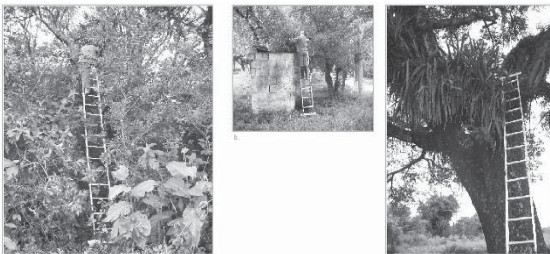
Fig. 2. Mosquito habitats provided by the Aechmea distichantha , a bromeliad epiphyte in the Yungas of north-western Argentina. (2a) Aspect of residual primitive forest in Monte Bello, meters from bromeliads where larvae of Ae. aegypti were found. (2b) Aspect of the abandoned building where epiphytic bromeliads were found from which the larvae of Ae. aegypti were collected. (2c) Epiphytic bromeliads from which larvae of Ae. aegypti and Cx. quinquefasciatus were collected at Iltico.

and Cx. quinquefasciatus in bromeliads located in wild and semi-urban environments could indicate a possible degree of invasion and adaptation to the primitive forest, or they may be a consequence of high infestations levels in nearby houses (Malta Verajao et al. 2005). This finding requires in-depth studies to reveal the real behavior of these