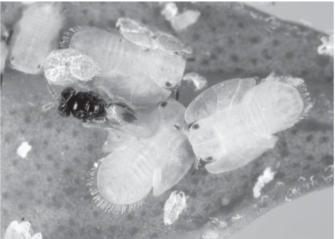
Fig. 1. Female Tamarixia radiata ovipositing into an early 5th instar Diaphorina citri nymph.

Male and female are the similar in color and body structure, except for antennae and a some-