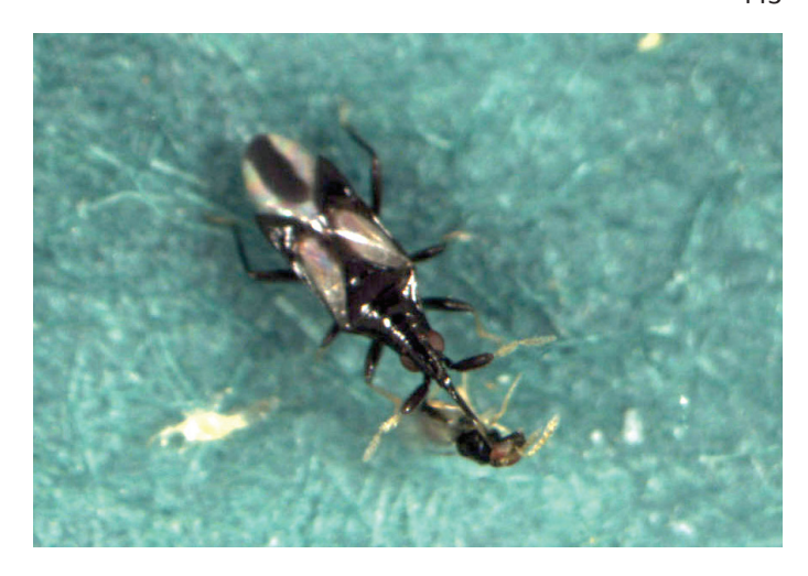
Fig. 3. Montandoniola confusa (Anthocoridae) attacking Thripistichus gentilei. This predator also feeds on the eggs and immature stages of Gynaikothrips species.