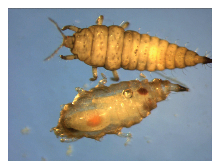
Fig. 1. Two immatures of Gynaikothrips uzeli : the upper individual is a normal larva, and the lower one displays the transparent, swollen appearance of a parasitized larva. The parasitoid, Thripistichus gentilei , develops with a polarity that is reverse relative to the host.

Our objectives were to determine the life stage(s) of G. uzeli parasitized by T. gentilei , the development period at a constant temperature, and the longevity of T. gentilei adults. These objectives were iden-