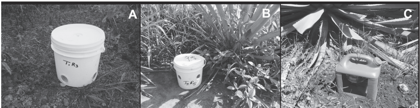
Fig. 1. Handmade designs of traps evaluated for capturing agave weevil on "maguey espadín" in Guerrero, Mexico. (A) TOCCI trap, (B) TOCCIA trap, and (C) container trap. In the 2nd experiment, TOCCIA traps were buried in the soil to the level of the holes.

In the 1st experiment, we evaluated 3 types of traps to capture the agave weevil: 1) TOCCI trap (Fig. 1A) at ground level (as recommended