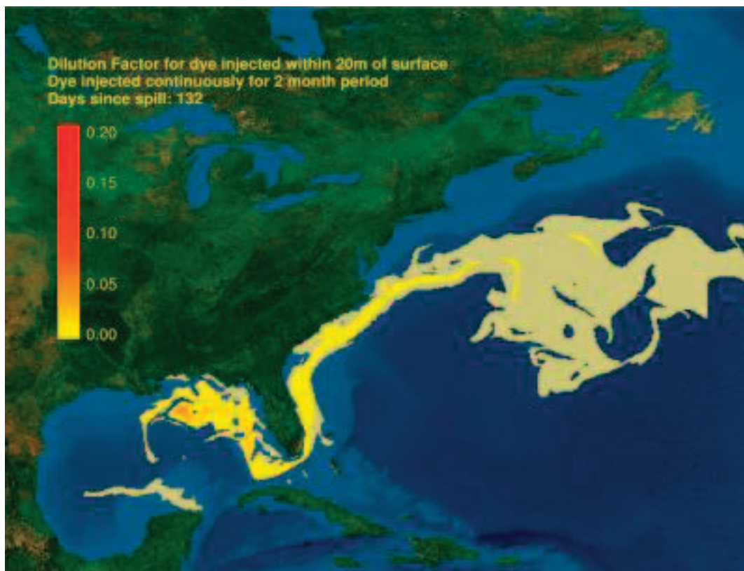
Figure 2. Oil trajectory after 130 days, predicted by the CCSM model for the Deepwater Horizon oil spill. Credits: National Center for Atmospheric Research and Department of Energy.

(evaporated, etc.), and information for defensive booming and skimming of the oil.