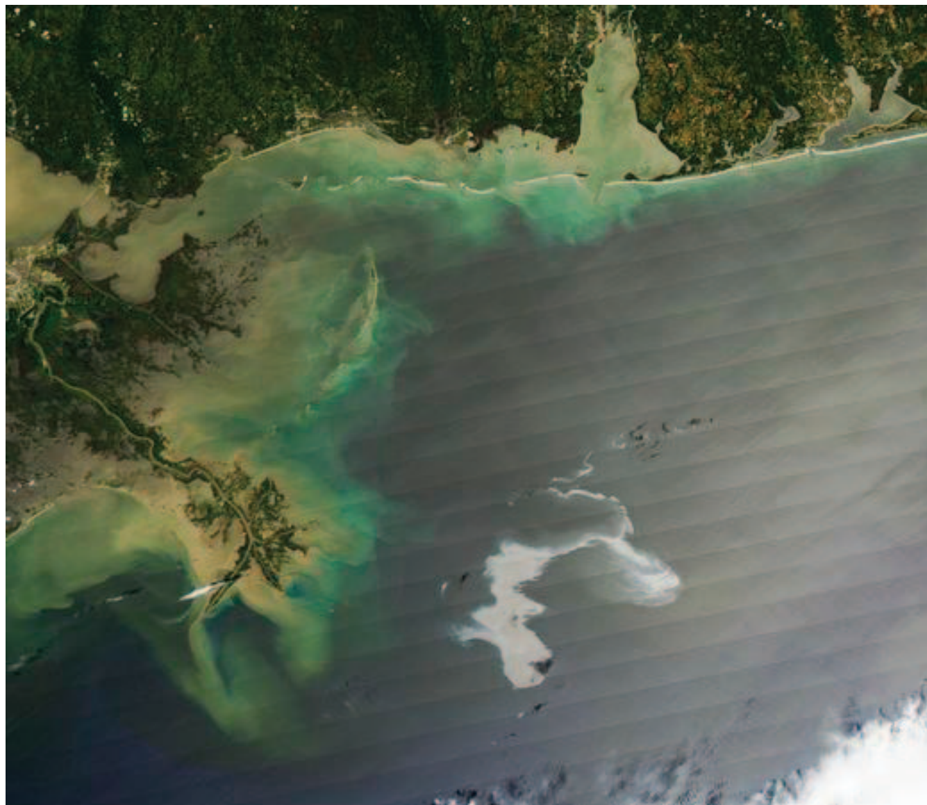
Figure 1. Deepwater Horizon oil spill captured on April 29, 2010, by MODIS imager on NASA's Aqua satellite. With the Mississippi Delta on the left, the silvery oil slick is clearly visible.