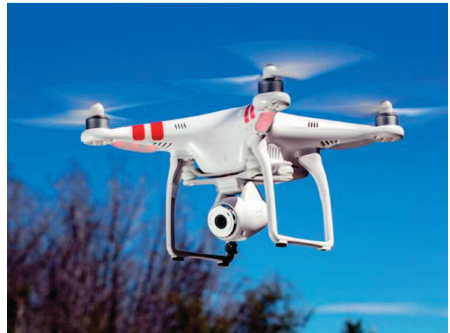
Figure 2. DJI Phantom 2 Vision Quadcopter with integrated camera.

Unmanned helicopters come in many different configurations. One popular, stable design is the quadcopter, a multi-rotor helicopter that is lifted and propelled by four rotors. Quadcopters use two sets of identical fixed-pitch propellers: two rotating clockwise and two counterclockwise. Control of