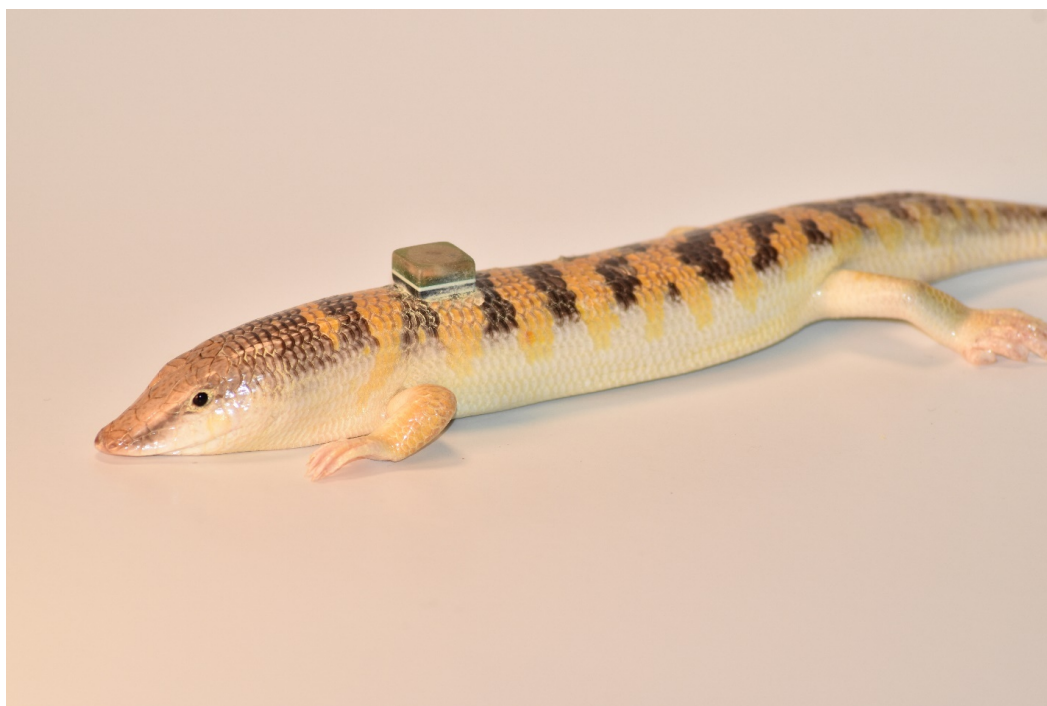
FIG. 1. Sandfish Skink ( Scincus scincus ) with a wireless CubiSens temperature data logger on its back. The temperature logger (CubiSens TS100; CubeWorks, Ann Arbor, Michigan, USA) adhered to the dorsum measures 7.5 \times 9.4 \times 4.2 mm.