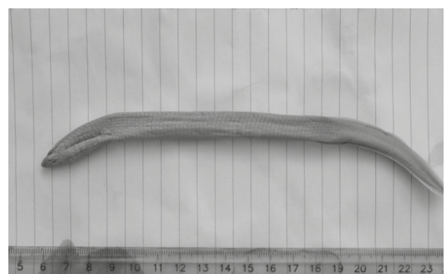
Fig. 2. A specimen from the River Gostelja, an upper tributary of the River Bosna, first mentioned as Lampetra planeri (Adrović et al., 2012), but more probably Eudontomyzon vladykovi.

This review comprises a list of lamprey species from Bosnia and Herzegovina obtained by collating