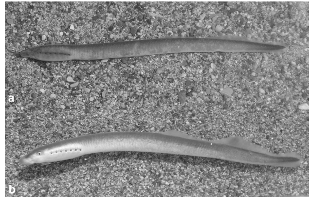
Fig. 4. Šoljan's brook lamprey, Lampetra soljani , a) ammocoetes, about 130 mm TL; side-arm of the River Neretva east of Čapljina; 17 Sep. 2014; b) prespawning adult (TL = 127 mm), from lower River Neretva east of Čapljina, Bosnia and Herzegovina 16-17 Jan. 2015.

Based on the available literature, lampreys represent the least studied and poorly known group of freshwater vertebrates in Bosnia and Herzegovina. Even though the investigation of the freshwater fish fauna of Bosnia and Herzegovina dates back to the middle of the nineteenth century (Heckel & Kner 1858), lampreys have received little attention for many years. The bulk of knowledge concerns their general biology and ecology, is mostly based only on species lists and lacks detailed morphological descriptions of species and localities (Vuković 1963, 1977, Vuković & Ivanović