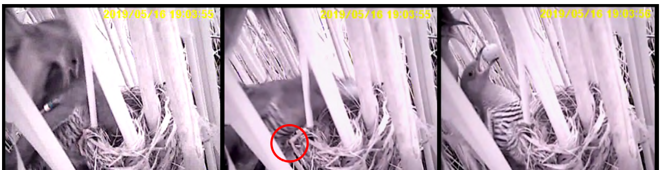
Fig. 2. Screenshots from the video-recording in which a female common cuckoo was knocked down from the nest by the great reed warbler female. The nest contained three host eggs and the cuckoo removed one of them during the attacks by the host female. The female cuckoo did not lay her own egg. The second frame shows that the cuckoo had a ring on her right tarsus (in the red circle). For the whole video, see supplementary online material.