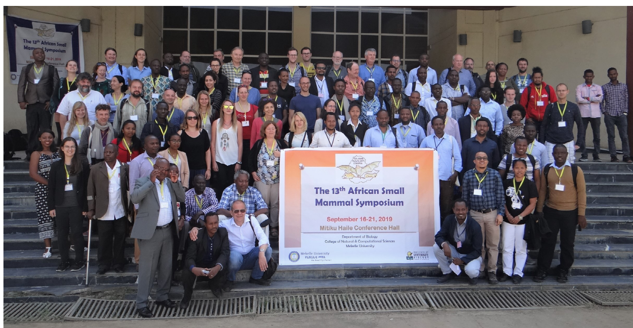
Fig. 2. Group photo of participants of the 13 th ASMS in Ethiopia.

Madagascar. For the first time there were also presentations about population and conservation genomics, niche modelling and a special session on subterranean rodents. The abstract book from this meeting is available at https://asms2019.ivb.cz/wp-content/uploads/12thASMS_Madagascar.pdf .