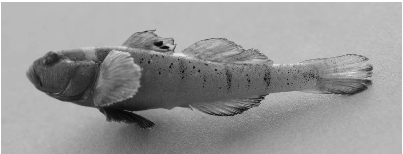
Fig. 5. Canestrini's goby Ninnigobius canestrinii (TL = 45.2 mm), caught on 25 May 2010 in the Hutovo Blato wetland, Bosnia and Herzegovina.

Pomatoschistus microps is a marine and brackish goby with a distribution extending to the eastern Atlantic, from Norway to Morocco, including