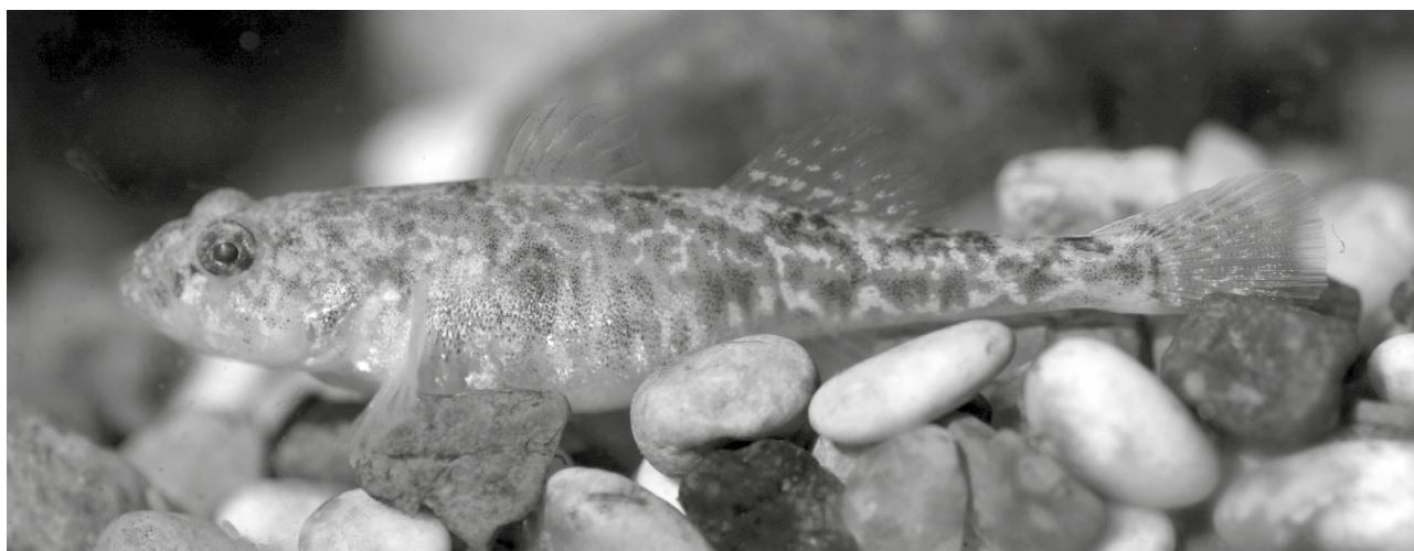
Fig. 4. Neretva dwarf goby Orsinigobius croaticus (TL = 41.7 mm), lower course of the Neretva River, Bosnia and Herzegovina.