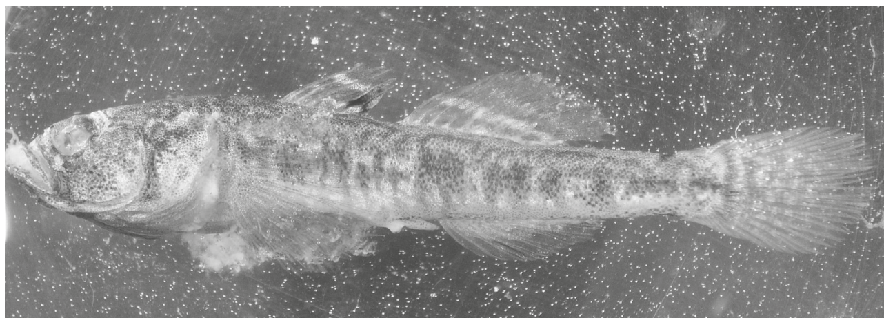
Fig. 2. Specimen from Hutovo Blato wetland, lower Neretva River catchment, firstly mentioned as unknown species (Ahnelt et al. 2009), but according to Šanda & Kovačić (2009) most probably Knipowitschia radovici.

Lake; Fig. 1). This species inhabits oligotrophic karst freshwaters in running and stagnant water, preferring silty habitats with sparse gravel and rocks (Šanda & Kovačić 2009, Tutman et al. 2013). It has been categorised as Vulnerable (VU; IUCN 2020), though it has not been assessed at the national level (Škrijelj et al. 2013).