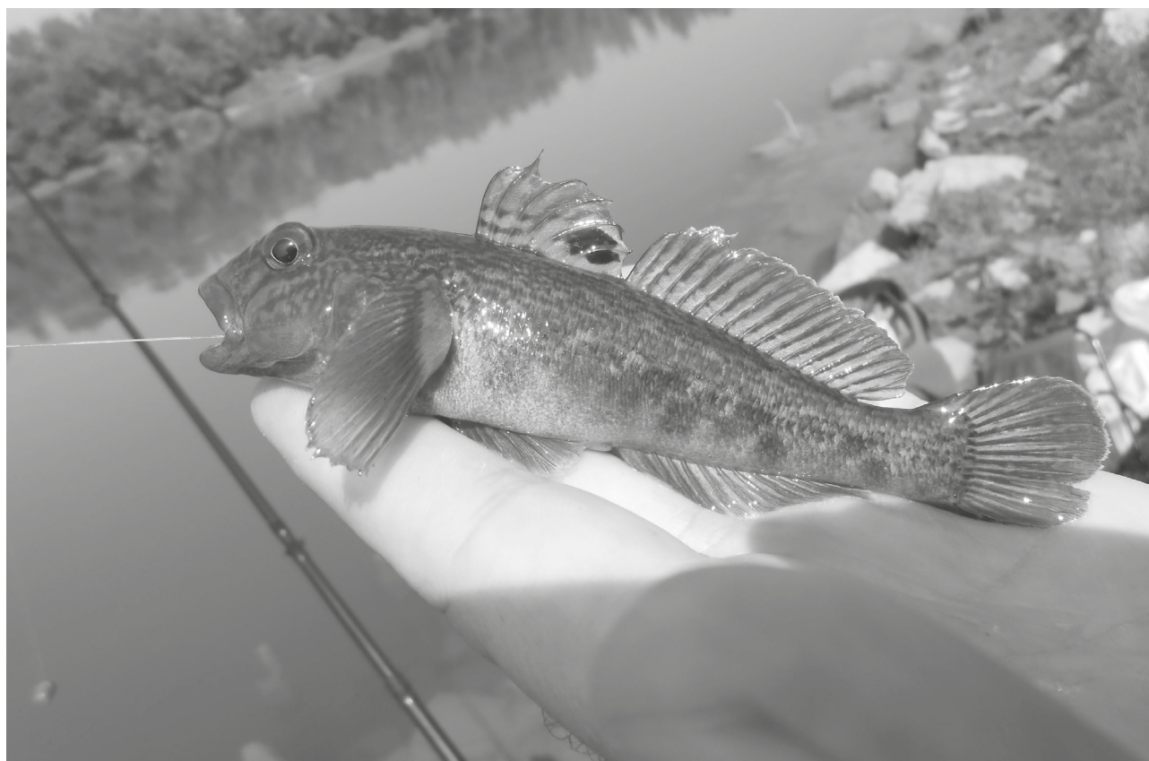
Fig. 3. Round goby Neogobius melanostomus from the Una River in Bosnia and Herzegovina (from Čolić et al. 2018; with the permission of Mr. Goran Šukalo).

Genus: Orsinigobius Gandolfi et al., 1986