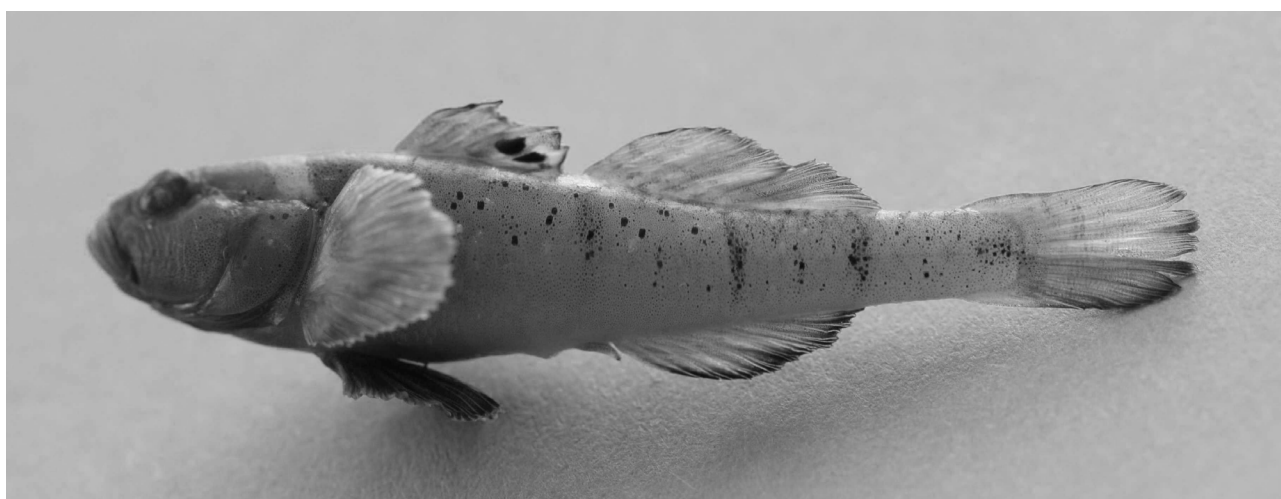
Fig. 5. Canestrini's goby Ninnigobius canestrinii (TL = 45.2 mm), caught on 25 May 2010 in the Hutovo Blato wetland, Bosnia and Herzegovina.

Pomatoschistus microps is a marine and brackish goby with a distribution extending to the eastern Atlantic, from Norway to Morocco, including