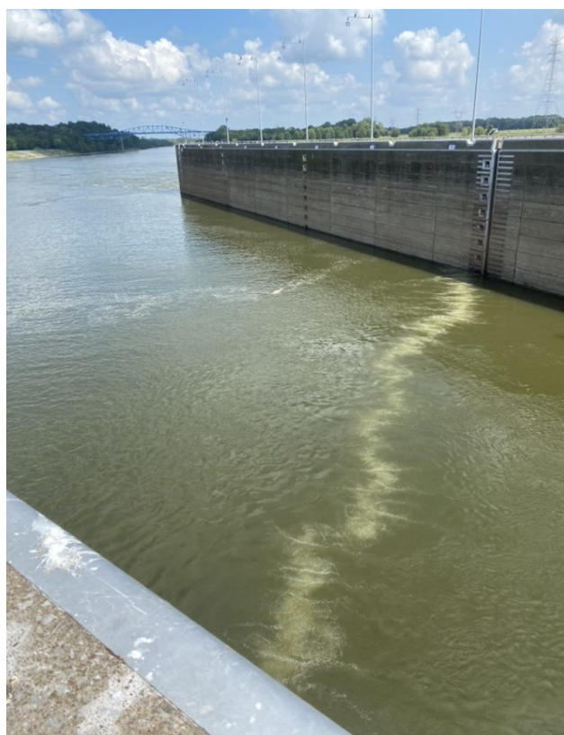
Fig. 3. An experimental BioAcoustic fish fence (BAFF) in operation at the downstream approach channel of Barkley lock on the River Cumberland near Grand Rivers, Kentucky. Photograph shows the air-bubble curtain when the system is turned on. The BAFF is planned to be operated for up to three years for a research study to evaluate its effectiveness to reduce upstream passage of invasive carps.

because populations downstream are greater than populations upstream and fish must use the lock to move upstream past the dam (Post van der Burg et al. 2021). This location is important for resource managers to cut off the source of invasive carps in the Ohio River Basin from migrating into the Tennessee River Basin. The primary objective of the field test at Barkley lock and Dam is to evaluate the effectiveness of a BAFF at preventing telemetered silver carp from moving upstream past the BAFF and into the lock chamber under the wide range of environmental conditions that occur at the site. Three native fish species (paddlefish Polyodon spathula Walbaum; smallmouth buffalo Ictiobus bubalus Rafinesque; freshwater drum Aplodinotus grunniens Rafinesque) are also telemetered as part of the BAFF evaluation to determine potential effects to native fishes.