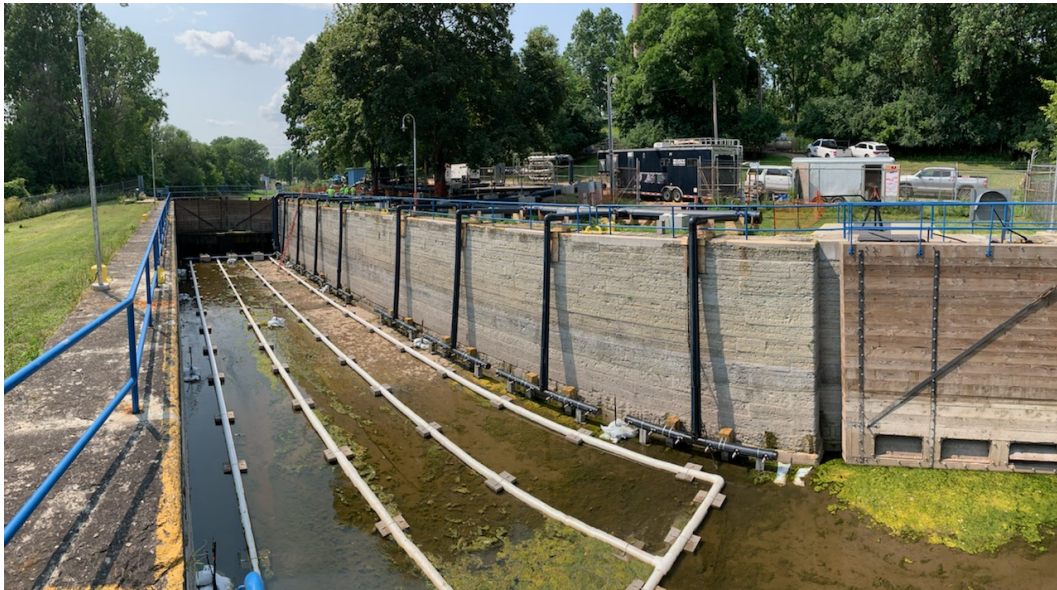
Fig. 4. Installation of an experimental carbon dioxide (CO 2 ) deterrent system at lock #2 on the River Fox near Kaukauna, Wisconsin. Photograph shows gas distribution piping on bottom and side of lock chamber. This system was temporarily installed for research purposes in 2019 to evaluate gas system engineering and performance within navigation lock chambers.

currently exist (Fig. 4; Zolper et al. 2019). One common method uses differential pressures to infuse CO 2 into water. Water from the lock is pumped into a pressurized mixing chamber while CO 2 at a slightly higher pressure is simultaneously injected into the mixing chamber to achieve supersaturated concentrations (e.g. 1,000-2,000 mg/L) prior to being distributed back to the lock. This recirculating process continues until complete mixing and target CO 2 concentrations in the lock are achieved. A second method involves direct gas injection within the application site. Carbon dioxide gas is applied directly into water via aeration using microbubble porous diffusers. Liquid CO 2 storage systems coupled with gas vaporization make either application system viable for large-scale application. Both CO 2 injection methods are used worldwide for wastewater and effluent water treatment processes and have been adapted to control invasive carps (Zolper et al. 2019).