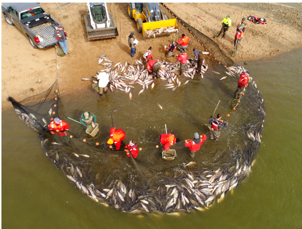
Fig. 5. Mass removal from a modified unified method (MUM) event in Creve Coeur Lake near St. Louis, Missouri. Silver carp were driven into a final collection area and contained within a large seine for sorting and removal. Approximately 108,000 kg of silver carp were removed from the lake during this multi-day process (photo Kevin Muenks – Missouri Department of Conservation, used with permission).

a location where abundances were extremely low. This application in Pool 8 was useful for monitoring purposes and may result in early detection or rapid response actions in those areas. Continued research would be beneficial to refine MUM methods and techniques, but resource managers could consider current MUM techniques as an available tool to support population control efforts.