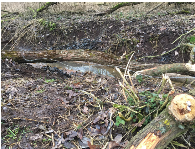
Fig. 2. Location of beaver occurrence in the Stobrawa Landscape Park (southwestern Poland).

The first day of each trip was devoted to setting the traps, which were then checked during the following days. Traps were placed at the study areas for two days on each trip. Our research was not conducted on a continuous basis, but in the form of ten separate trips. A hair sample was defined as all the hair collected from a single barb, including both guard hairs and undercoat fur. Samples were placed in test tubes with ethyl alcohol, and stored at -20 °C.