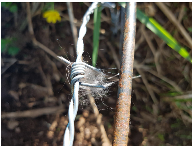
Fig. 3. A beaver hair sample containing undercoat and guard hair.