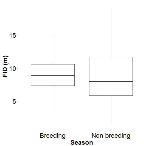
Fig. 1. Seasonal difference in flight initiation distance (FID).