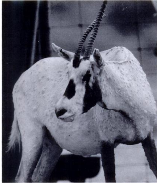
FIGURE 1. Arabian oryx female with the whole body covered with lumps.

(21°17'N, 40°40'E), Saudi Arabia, was created in 1986, as part of the national oryx conservation action plan, with 56 animals coming from the late King Khaled farm near Riyadh. Because of a tuberculosis outbreak that occurred in 1986 and 1987, the founder group had been kept isolated in 1 area of the N.W.R.C., without any possible contact with the F1 and F2 generations. No other oryx had been introduced in the herd since its creation. The animals had no direct contact with other ungulate species. The animals were housed in 240 m 2 individual pens or in 0.5 to 25 ha enclosures in groups of one to five individuals.