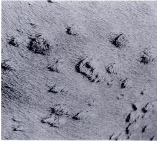
FIGURE 2. Macroscopic view of the nodules.

it remained recumbent and trembled and no sedative or anesthetic for restraint was required. The animal developed a left side torticollis, 9 days after the first clinical signs. From day 11, the general condition gradually improved and the animal began to stand and eat again. The body temperature became normal, taken when the animal was recumbent and restrained manually. On day 13, it aborted possibly due to the disease or in response to the corticosteroid treatment. No lesion was noticed in the aborted calf. Serology for evidence of brucellosis by seroagglutination test, Rose Bengale plate test, complement fixation test, and of Q fever and chlamydiosis by the complement fixation test was proved negative.