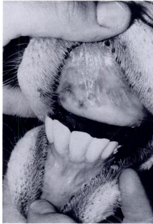
FIGURE 3. Two ulcers on the gum.

On the seventh day, the cutaneous lesions were 1,300 to 1,400 firm, round, raised non-sensitive nodules, with all the hairs raised in the same direction (Fig. 2). Nodules varied between 0.5 and 4 cm in diameter and involved the whole thickness of the skin but without adhering to subcutaneous tissues. A few round, <1 cm diameter, ulcers were present on the gums (Fig. 3), the vulva and the skin surrounding the anus. Healing of the cutaneous nodules was slow. By the end of September most of them remained. Some nodules dropped off leaving an open wound with a pink dry scab. Most of the nodules did