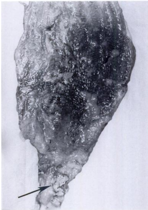
FIGURE 1. Gastric mucosa of a frilled lizard from Australia showing a dark color, prominent rugae and excessive amounts of mucus. Note also the firm yellow-white material on the pyloric mucosa (arrow).