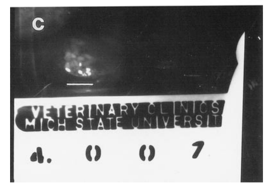
FIGURE 1. Radiographs of steel (a), tungsten-iron (b), and tungsten-polymer (c) pellets in the proventriculus/ventriculus of mallards. The radiographs were taken 10 days after the final administration of eight pellets (40 pellets total). The numbers refer to the duck's individual identification numbers. Notice the extent of erosion of tungsten-iron and particularly tungsten-polymer pellets compared to steel pellets. Bar = 10 \, \text{mm} .

posure periods in these studies were considerably shorter than in the present study.