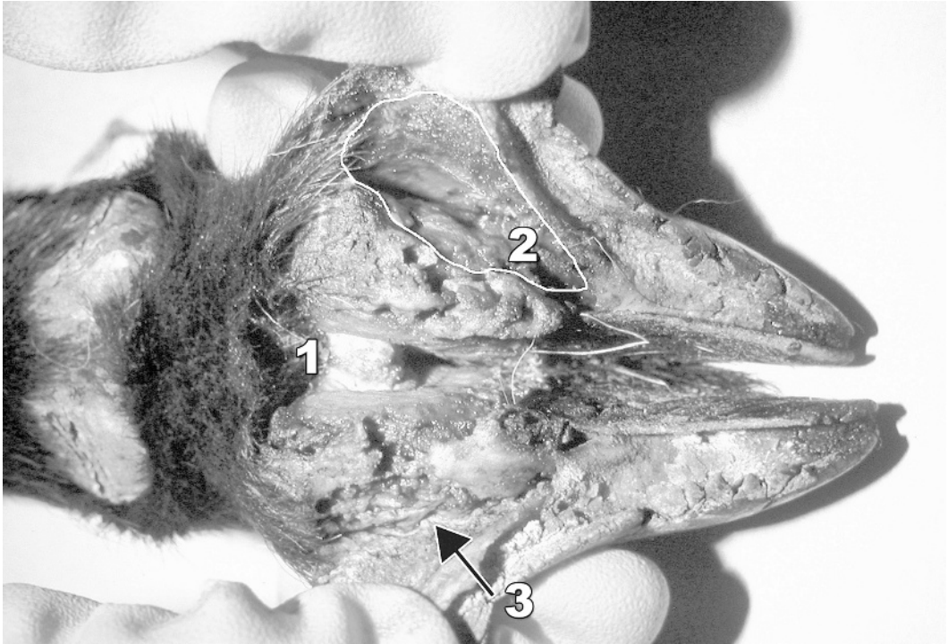
FIGURE 2. Anterior foot of a male ibex with interdigital exudative dermatitis (1), sole ulcer (2) and detachment of the horn of the wall (white line, 3). The sole ulcer was covered by an overgrowth of horn of the bearing border (removed to reveal the ulcer).

Therefore, it was not possible to study benign or intermediate forms of infection or feet from healthy wild animals, which could serve as negative controls. However, the pathological lesions observed in addition to our PCR results are compatible with the hypothesis that D. nodosus causes foot rot in free-ranging ibex and mouflon.