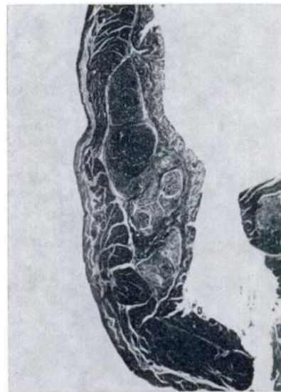
FIGURE 1. The mucosa is a thin portion to the right and the muscularis mucosa is represented as a thinner darker line. Several nodules are seen which are bordered on the left by muscle. H. and E. X 16.

Within the body of this lesion were sections of small nematodes (Fig. 3) compatible with the morphology of Heterakis sp. 13 Nematodes were found in all nodules.